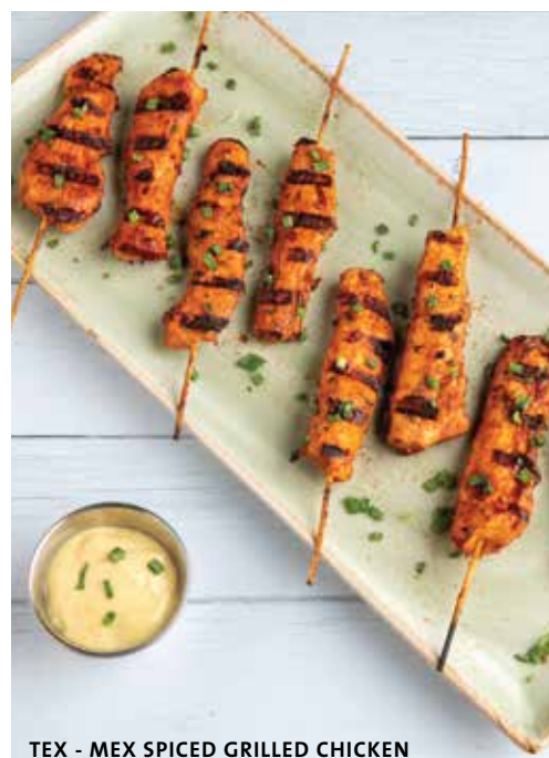
TEX - MEX SPICED GRILLED CHICKEN

We hold allergy information for all menu items, please speak to your server for further details. Govt. taxes extra as applicable on food & beverages (alcoholic/non-alcoholic). We levy 10% service charge on all food & beverages. If you suffer from a food allergy, please ensure that your server is aware at the time of order. † Contains nuts or seeds. * These items contain (or may contain) raw or undercooked ingredients. Consuming raw or undercooked hamburgers, meats, poultry, seafood, shellfish or eggs may increase your risk of foodborne illness, especially if you have certain medical conditions. • Vegetarian • Non-Vegetarian. Images for representational purposes only