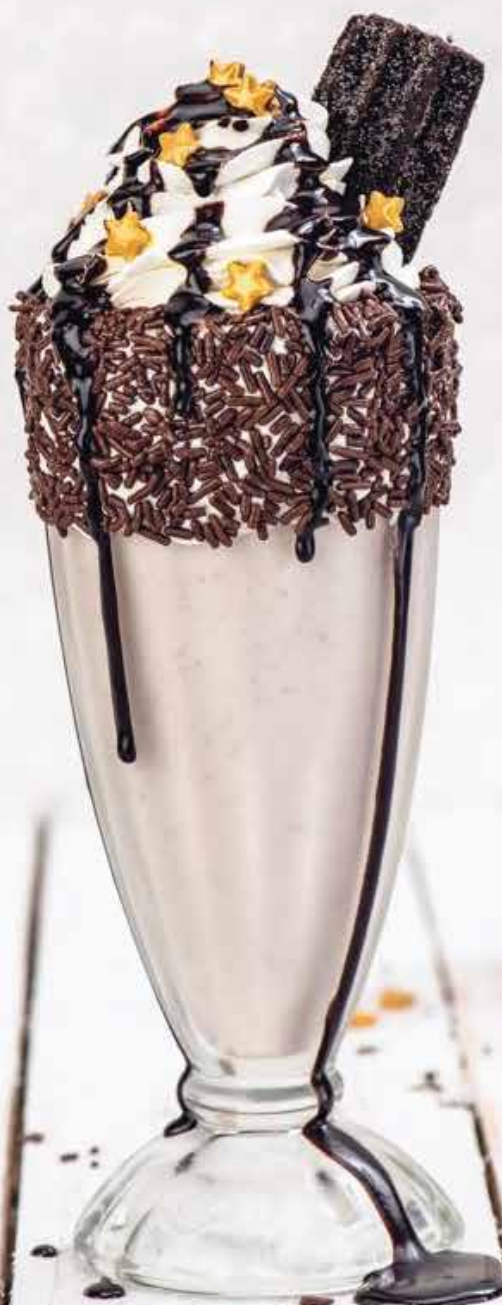
COOKIES & CREAM MILKSHAKE