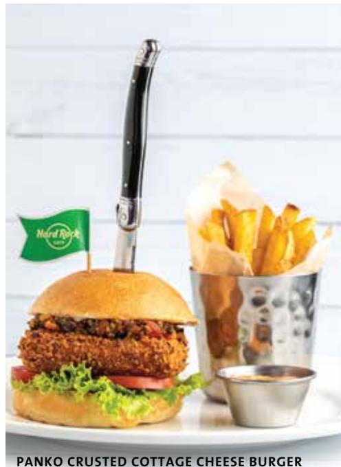
PANKO CRUSTED COTTAGE CHEESE BURGER

We hold allergy information for all menu items, please speak to your server for further details. Govt. taxes extra as applicable on food & beverages (alcoholic/non-alcoholic). We levy 10% service charge on all food & beverages. If you suffer from a food allergy, please ensure that your server is aware at the time of order. † Contains nuts or seeds. * These items contain (or may contain) raw or undercooked ingredients. Consuming raw or undercooked hamburgers, meats, poultry, seafood, shellfish or eggs may increase your risk of foodborne illness, especially if you have certain medical conditions. • Vegetarian • Non-Vegetarian. Images for representational purposes only