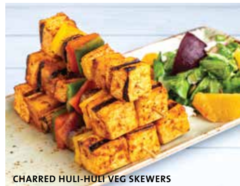
CHARRED HULI-HULI VEG SKEWERS