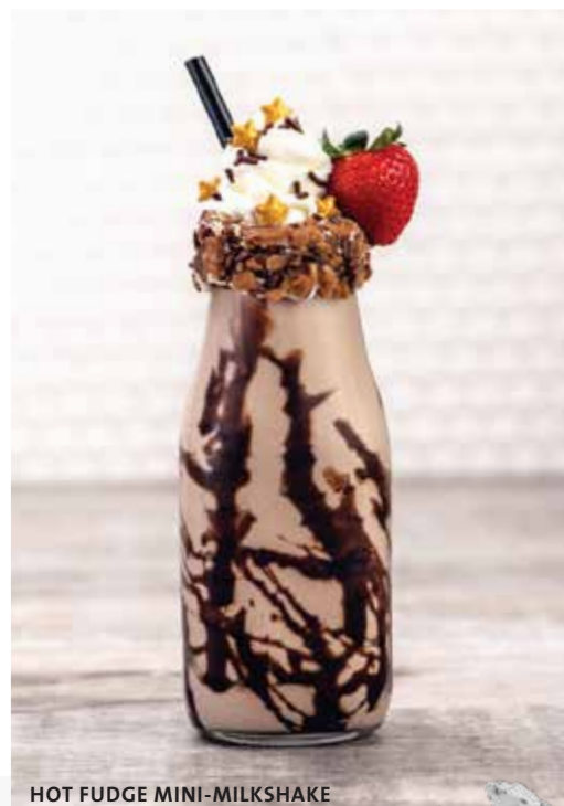
HOT FUDGE MINI-MILKSHAKE