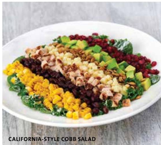
CALIFORNIA-STYLE COBB SALAD