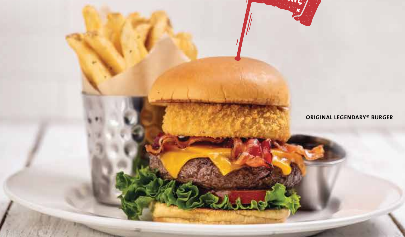
ORIGINAL LEGENDARY® BURGER