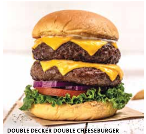
DOUBLE DECKER DOUBLE CHEESEBURGER

We hold allergy information for all menu items, please speak to your server for further details. Govt. taxes extra as applicable on food & beverages (alcoholic/non-alcoholic). We levy 10% service charge on all food & beverages. If you suffer from a food allergy, please ensure that your server is aware at the time of order. † Contains nuts or seeds. * These items contain (or may contain) raw or undercooked ingredients. Consuming raw or undercooked hamburgers, meats, poultry, seafood, shellfish or eggs may increase your risk of foodborne illness, especially if you have certain medical conditions. • Vegetarian • Non-Vegetarian. Images for representational purposes only.