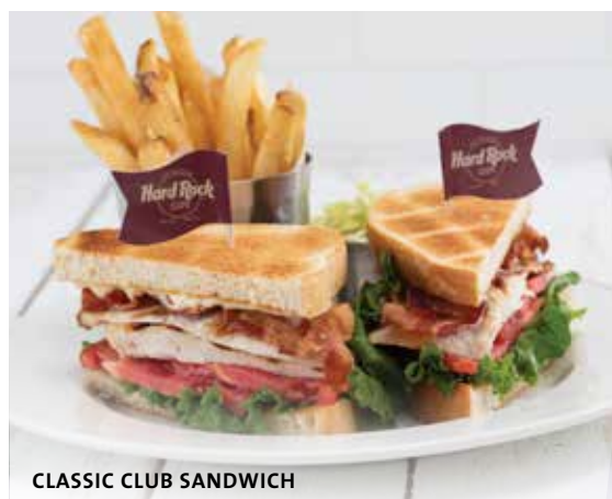
CLASSIC CLUB SANDWICH