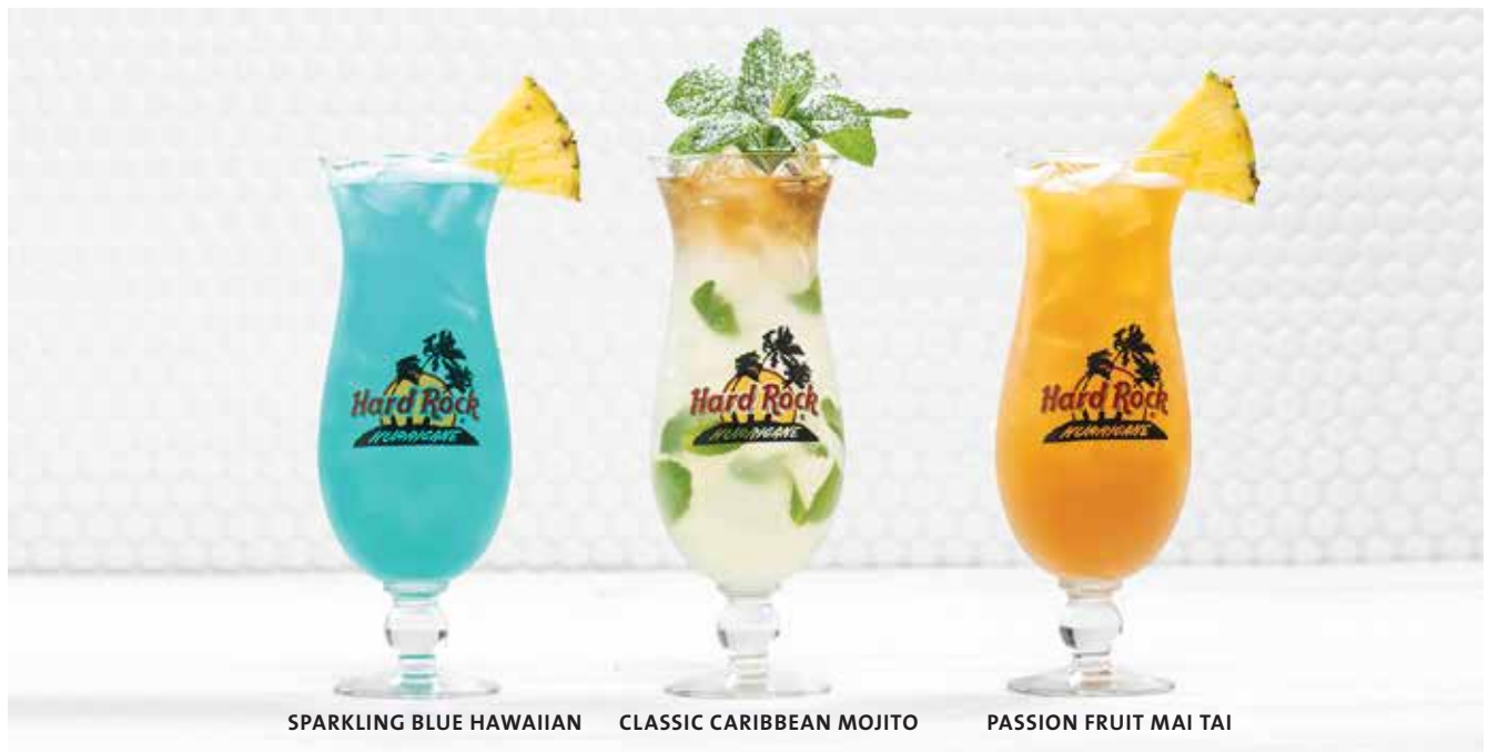
SPARKLING BLUE HAWAIIAN