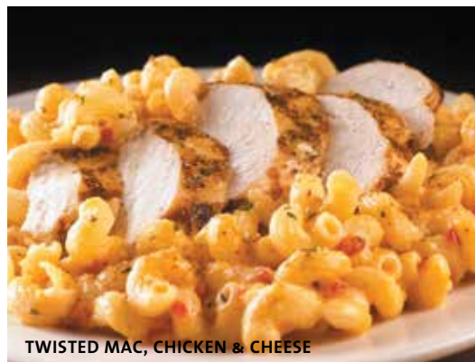
TWISTED MAC, CHICKEN & CHEESE