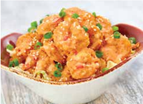
ONE NIGHT IN BANGKOK SPICY SHRIMP™