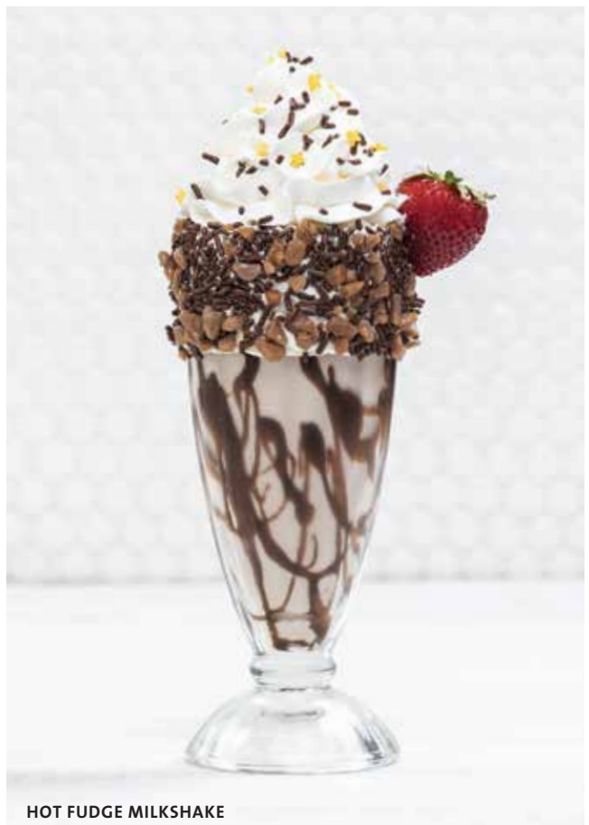
HOT FUDGE MILKSHAKE

Jim Beam Bourbon, Captain Morgan Dark Rum, vanilla ice cream, dark chocolate sauce and a hint of coconut, finished with whipped cream, a chocolate butterscotch rim and a fresh strawberry. • (A) ₹650 Non-Alcoholic version, served in a signature mini-milk jug • ₹450