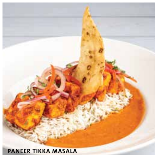
PANEER TIKKA MASALA