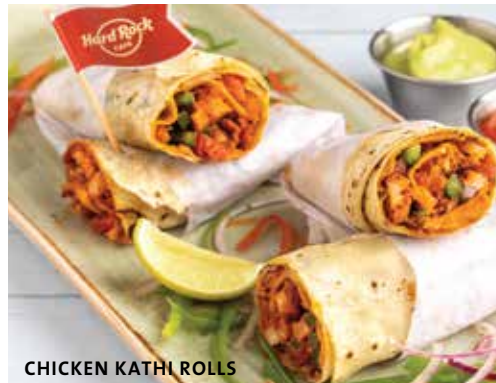
CHICKEN KATHI ROLLS