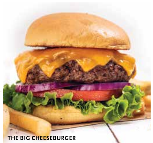
THE BIG CHEESEBURGER