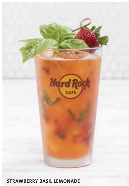
STRAWBERRY BASIL LEMONADE

We hold allergy information for all menu items, please speak to your server for further details. Govt. taxes extra as applicable on food & beverages (alcoholic/non-alcoholic). We levy 10% service charge on all food & beverages. If you suffer from a food allergy, please ensure that your server is aware at the time of order. † Contains nuts or seeds. ● Vegetarian ● Non-Vegetarian. Images for representational purposes only