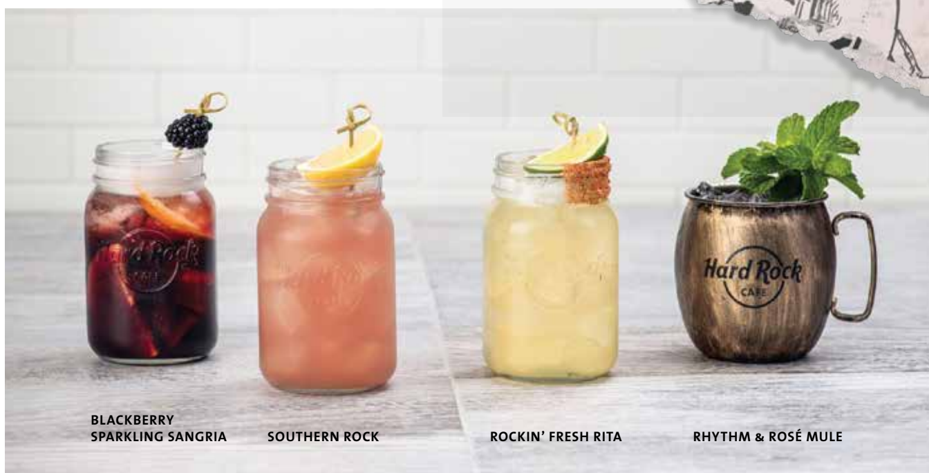
BLACKBERRY SPARKLING SANGRIA