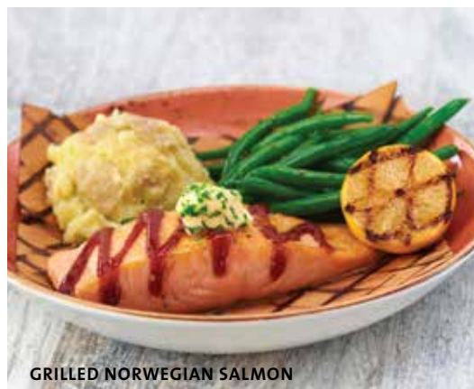
GRILLED NORWEGIAN SALMON

We hold allergy information for all menu items, please speak to your server for further details. Govt. taxes extra as applicable on food & beverages (alcoholic/non-alcoholic). We levy 10% service charge on all food & beverages. If you suffer from a food allergy, please ensure that your server is aware at the time of order. † Contains nuts or seeds. * These items contain (or may contain) raw or undercooked ingredients. Consuming raw or undercooked hamburgers, meats, poultry, seafood, shellfish or eggs may increase your risk of foodborne illness, especially if you have certain medical conditions. • Vegetarian • Non-Vegetarian. Images for representational purposes only