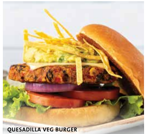
QUESADILLA VEG BURGER