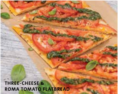
THREE-CHEESE & ROMA TOMATO FLATBREAD