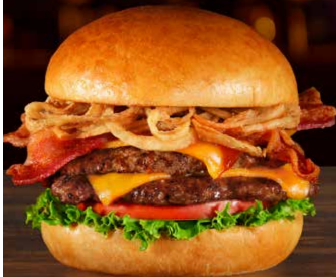
BBQ Bacon Smashed Burger