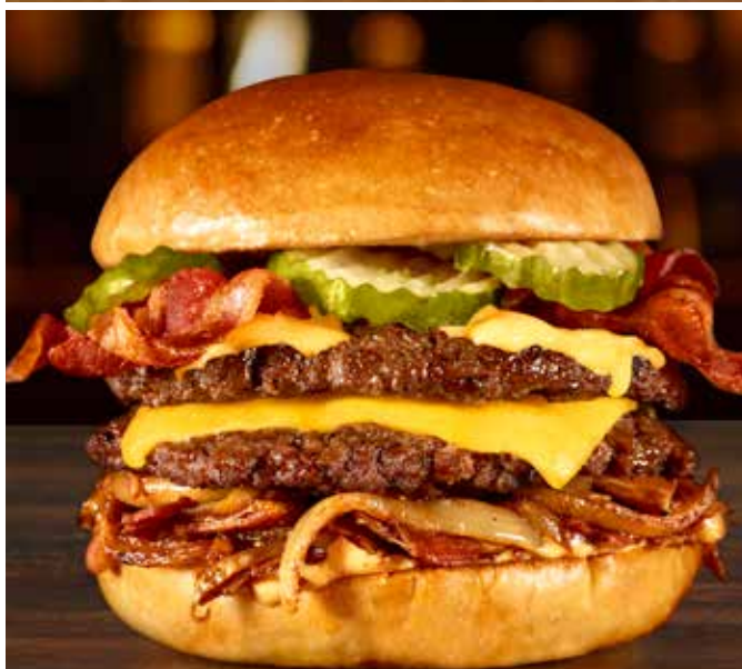
Legendary ® Smashed Burger

We hold allergy information for all menu items, please speak to your server for further details. If you suffer from a food allergy, please ensure that your server is aware at the time of order. * Contains nuts or seeds. † These items contain (or may contain) raw or undercooked ingredients. Consuming raw or undercooked hamburgers, meats, poultry, seafood, shellfish or eggs may increase your risk of foodborne illness, especially if you have certain medical conditions. ‡ If product is not available it may be substituted by a frozen product that is produced at time of manufacture. (V) Vegetarian, (VG) Vegan.