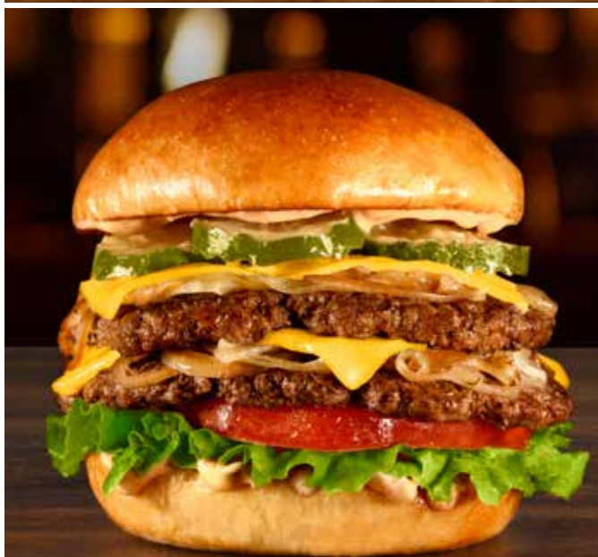
The Classic Smashed Burger