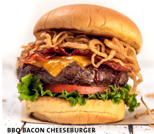
BBQ BACON CHEESEBURGER