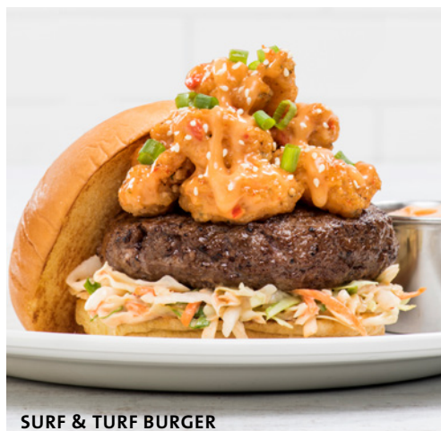
SURF & TURF BURGER

We hold allergy information for all menu items, please speak to your server for further details. If you suffer from a food allergy, please ensure that your server is aware at the time of order. † Contains nuts or seeds. * These items contain (or may contain) raw or undercooked ingredients. Consuming raw or undercooked hamburgers, meats, poultry, seafood, shellfish or eggs may increase your risk of foodborne illness, especially if you have certain medical conditions. # (GF) Gluten-Free, (V) Vegetarian, (VG) Vegan. Δ These dishes can be modified for a Gluten-Free, Vegetarian or Vegan option. (GF-A) Gluten-Free available, (V-A) Vegetarian available, (VG-A) Vegan available. © 2023 Hard Rock International - 6/23 - F - Barcelona ENG Please talk to your server to arrange any dietary needs.