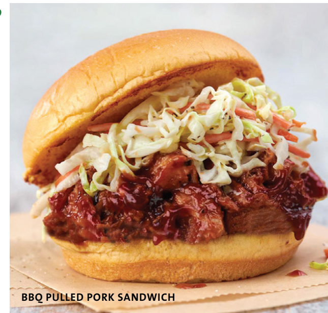
BBQ PULLED PORK SANDWICH

Buttermilk-marinated fried chicken tossed with our classic buffalo sauce with leaf lettuce, vine-ripened tomato and ranch dressing, served on a toasted fresh brioche bun. kr 269