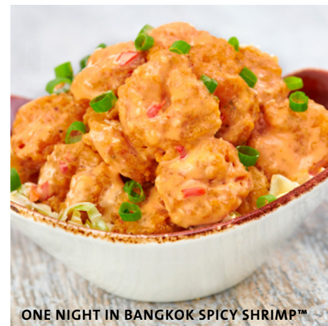
ONE NIGHT IN BANGKOK SPICY SHRIMP™

We hold allergy information for all menu items, please speak to your server for further details. If you suffer from a food allergy, please ensure that your server is aware at the time of order. † Contains nuts or seeds. * These items contain (or may contain) raw or undercooked ingredients. Consuming raw or undercooked hamburgers, meats, poultry, seafood, shellfish or eggs may increase your risk of foodborne illness, especially if you have certain medical conditions. # (GF) Gluten-Free, (V) Vegetarian, (VG) Vegan. Δ These dishes can be modified for a Gluten-Free, Vegetarian or Vegan option. (GF-A) Gluten-Free available, (V-A) Vegetarian available, (VG-A) Vegan available. © 2023 Hard Rock International - 6/23 - F - Barcelona ENG Please talk to your server to arrange any dietary needs.