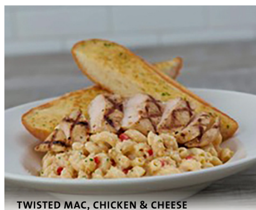
TWISTED MAC, CHICKEN & CHEESE

Crispy chicken tenders served with seasoned fries, honey mustard and our house-made barbecue sauce. kr 249