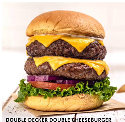
DOUBLE DECKER DOUBLE CHEESEBURGER