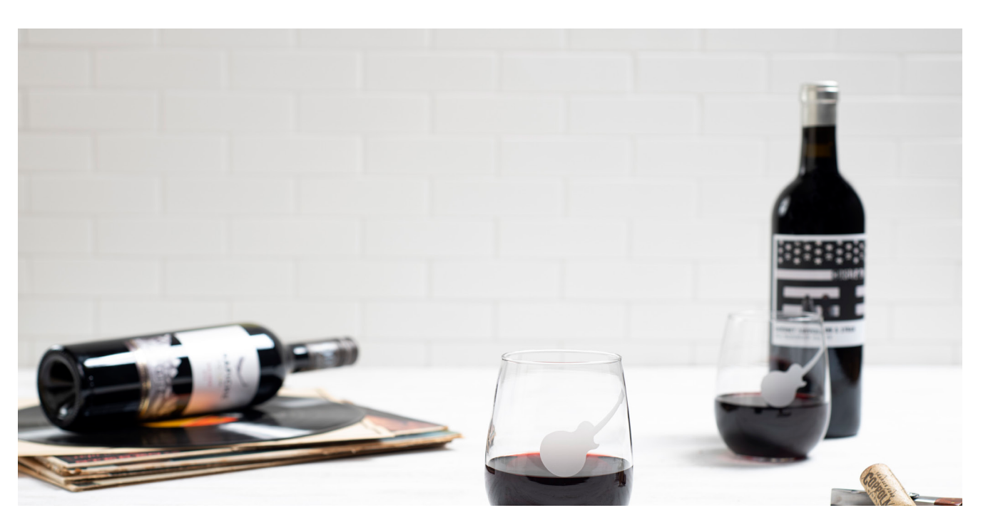
Prices quoted are subject to 10% Service Charge and 6% prevailing Government Taxes. Images shown are for illustration purpose only.