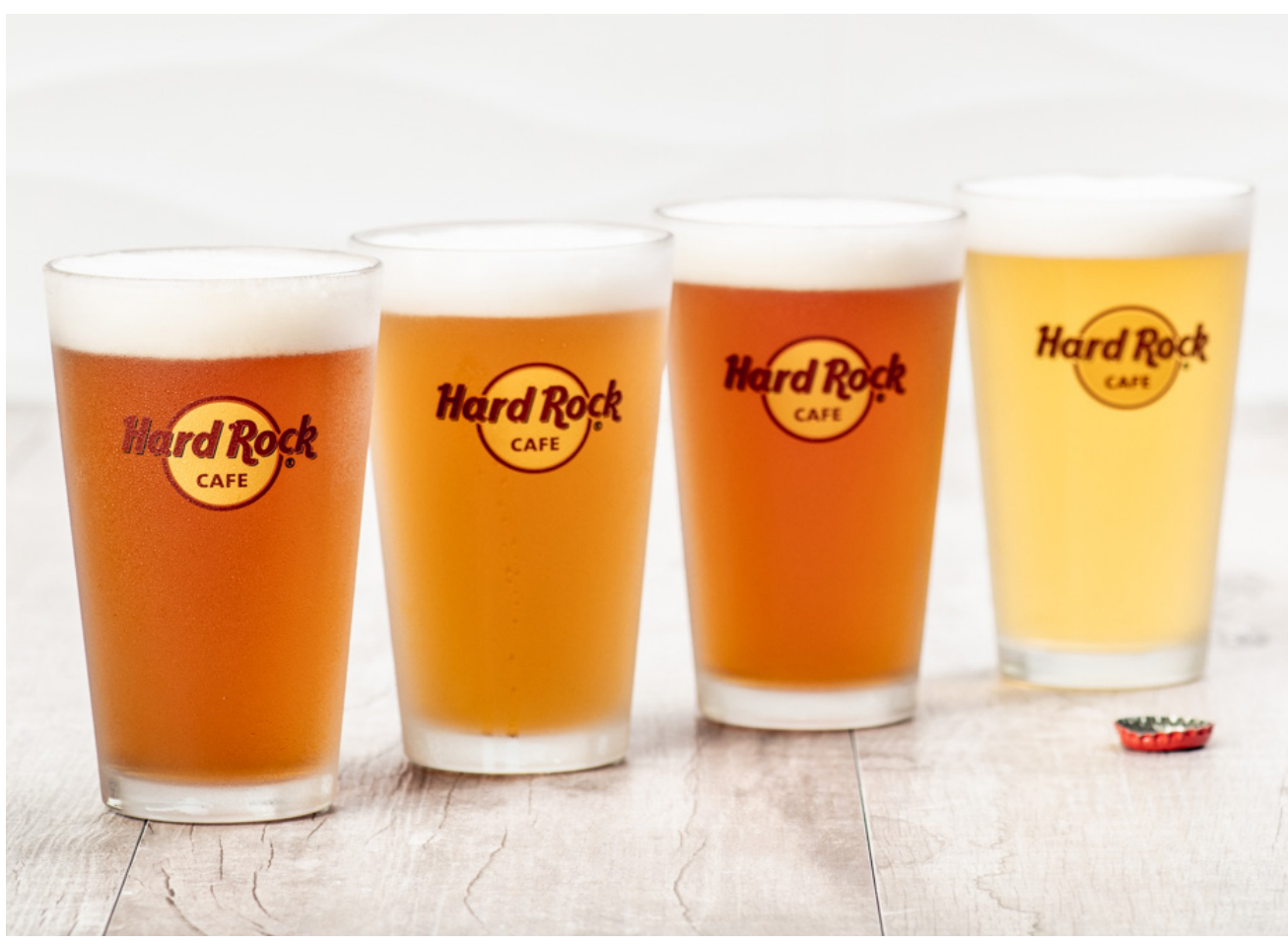
Prices quoted are subject to 10% Service Charge and 6% prevailing Government Taxes. Images shown are for illustration purpose only.