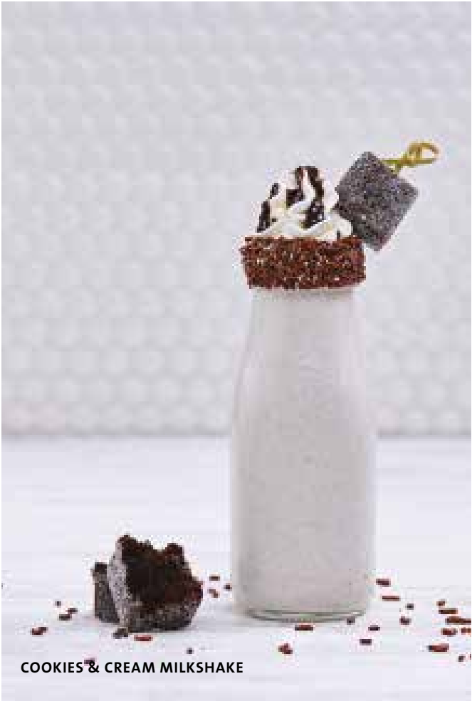
COOKIES & CREAM MILKSHAKE

We hold allergy information for all menu items, please speak to your server for further details. If you suffer from a food allergy, please ensure that your server is aware at time of order. † Contains nuts or seeds. # (GF) Gluten-Free, (V) Vegetarian, (VG) Vegan. Δ These dishes can be modified for a Gluten-Free, Vegetarian or Vegan option. (GF-A) Gluten-Free available, (V-A) Vegetarian available, (VG-A) Vegan available. Please talk to your server to arrange any dietary needs.