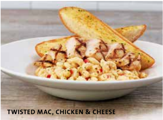
TWISTED MAC, CHICKEN & CHEESE

We hold allergy information for all menu items, please speak to your server for further details. If you suffer from a food allergy, please ensure that your server is aware at the time of order. † Contains nuts or seeds. * These items contain (or may contain) raw or undercooked ingredients. Consuming raw or undercooked hamburgers, meats, poultry, seafood, shellfish or eggs may increase your risk of foodborne illness, especially if you have certain medical conditions. # (GF) Gluten-Free, (V) Vegetarian, (VG) Vegan. Δ These dishes can be modified for a Gluten-Free, Vegetarian or Vegan option. (GF-A) Gluten-Free available, (V-A) Vegetarian available, (VG-A) Vegan available. Please talk to your server to arrange any dietary needs.