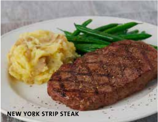
NEW YORK STRIP STEAK

Crispy chicken tenders served with seasoned fries, honey mustard and our house-made barbecue sauce. €17.95