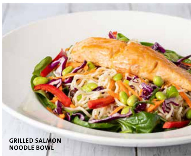
GRILLED SALMON NOODLE BOWL