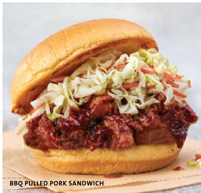
BBQ PULLED PORK SANDWICH

Buttermilk-marinated fried chicken tossed with our classic buffalo sauce with leaf lettuce, vine-ripened tomato and ranch dressing, served on a toasted fresh brioche bun. €17.95