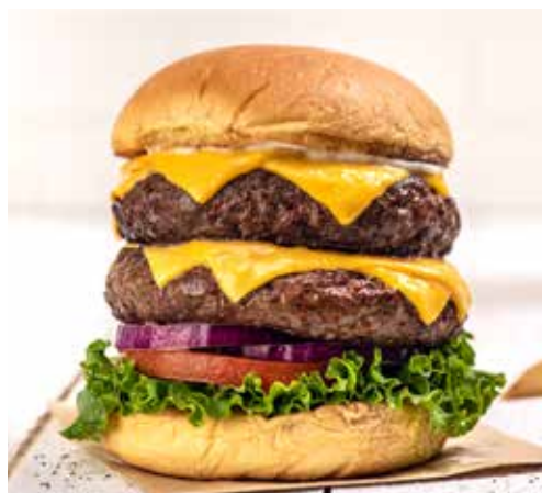
DOUBLE DECKER DOUBLE CHEESEBURGER