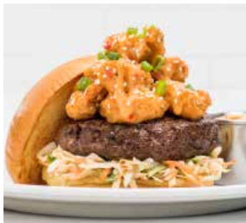
SURF & TURF BURGER

Two smashed & stacked burgers seasoned and seared medium-well, with Monterey Jack cheese, pickled jalapeños, leaf lettuce, vine-ripened tomato, and spicy mayonnaise.* Δ €18.95