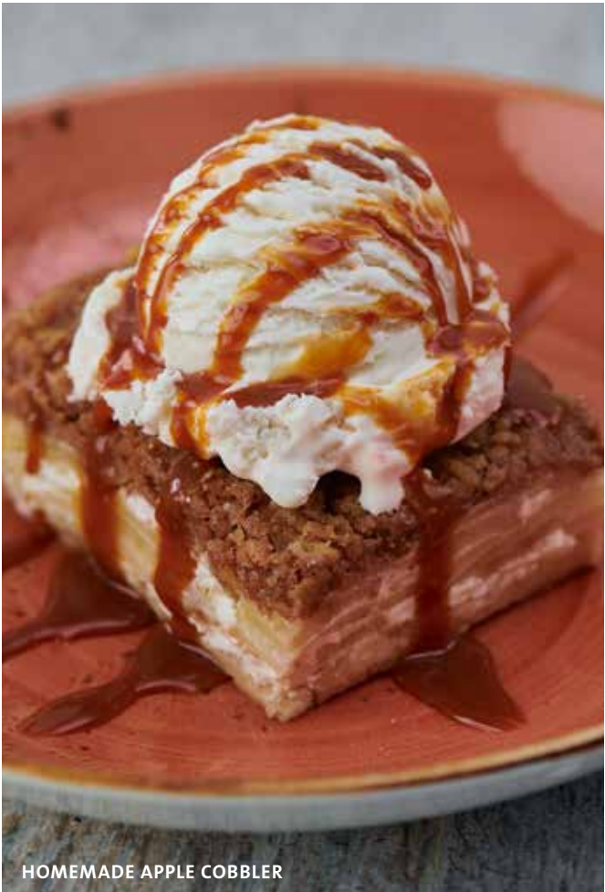
HOMEMADE APPLE COBBLER