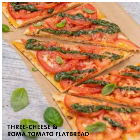
THREE-CHEESE & ROMA TOMATO FLATBREAD