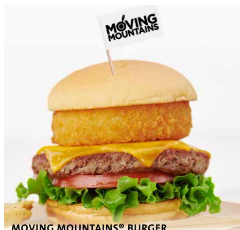
MOVING MOUNTAINS® BURGER

We hold allergy information for all menu items, please speak to your server for further details. If you suffer from a food allergy, please ensure that your server is aware at the time of order. † Contains nuts or seeds. * These items contain (or may contain) raw or undercooked ingredients. Consuming raw or undercooked hamburgers, meats, poultry, seafood, shellfish or eggs may increase your risk of foodborne illness, especially if you have certain medical conditions. ‡ (GF) Gluten-Free, (V) Vegetarian, (VG) Vegan. Δ These dishes can be modified for a Gluten-Free, Vegetarian or Vegan option. (GF-A) Gluten-Free available, (V-A) Vegetarian available, (VG-A) Vegan available. Please talk to your server to arrange any dietary needs.