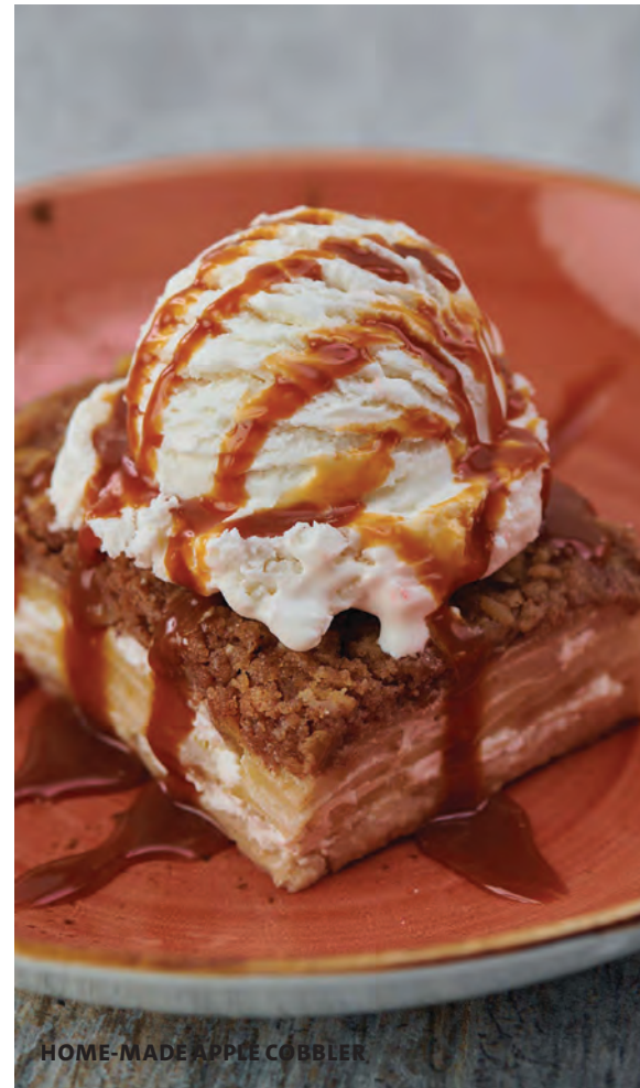
HOME-MADE APPLE COBBLER

We hold allergy information for all menu items, please speak to your server for further details. If you suffer from a food allergy, please ensure that your server is aware at the time of order. † Contains nuts or seeds. * These items contain (or may contain) raw or undercooked ingredients. Consuming raw or undercooked hamburgers, meats, poultry, seafood, shellfish or eggs may increase your risk of foodborne illness, especially if you have certain medical conditions. 2000 calories a day is used for general nutrition advice, but calorie needs vary. Additional nutritional information is available upon request. ©2024 Hard Rock International - 04/24