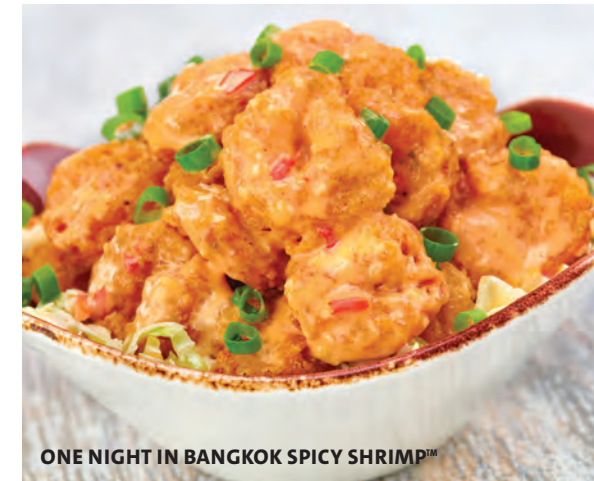
ONE NIGHT IN BANGKOK SPICY SHRIMP™