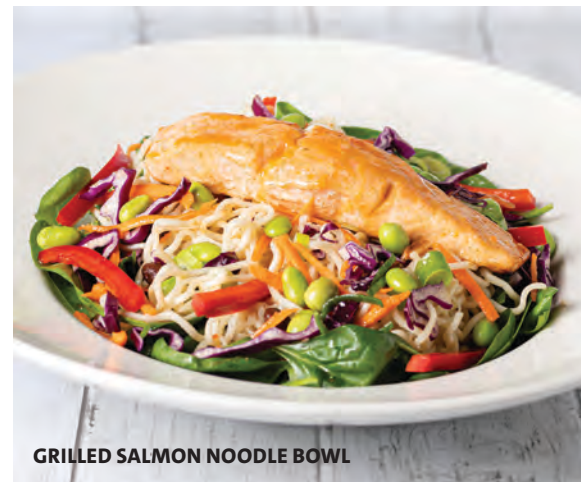
GRILLED SALMON NOODLE BOWL