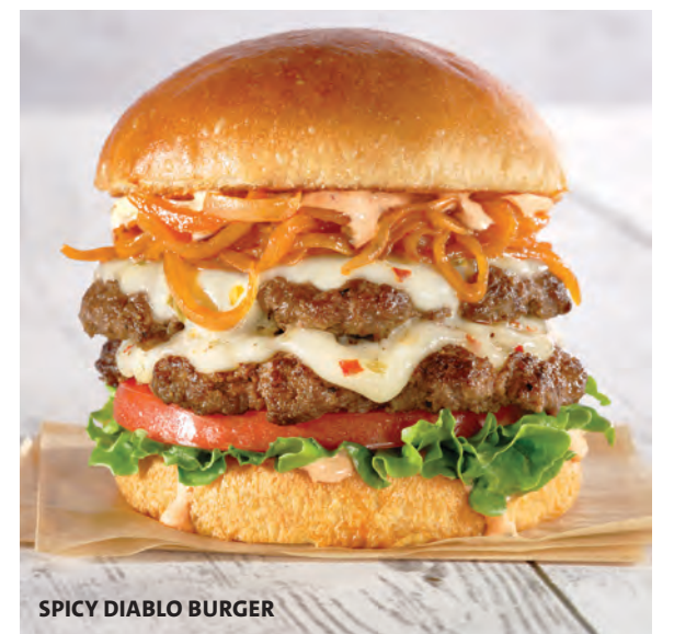
SPICY DIABLO BURGER