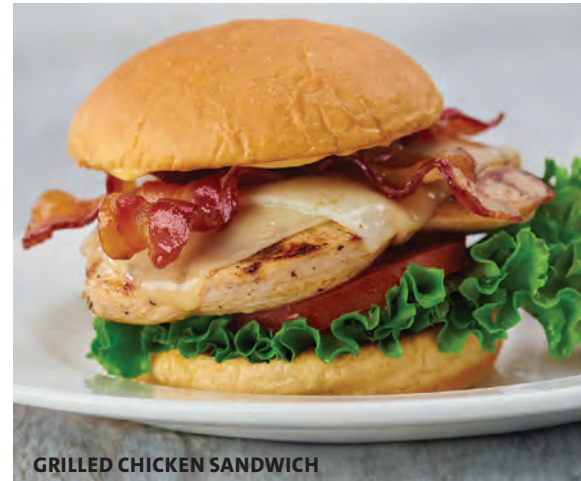
GRILLED CHICKEN SANDWICH