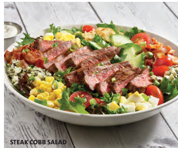
STEAK COBB SALAD