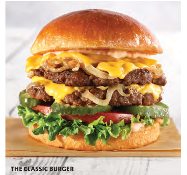
THE CLASSIC BURGER