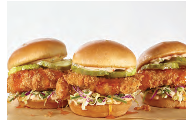
FRIED CHICKEN SLIDERS