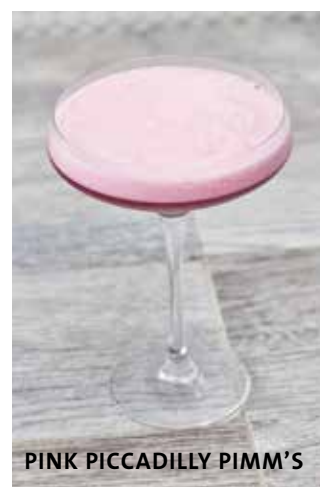
PINK PICCADILLY PIMM'S