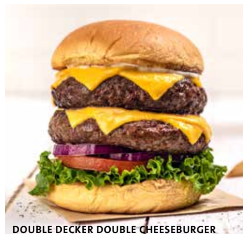
DOUBLE DECKER DOUBLE CHEESEBURGER