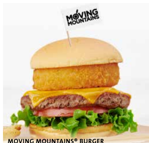
MOVING MOUNTAINS® BURGER

We hold allergy information for all menu items, please speak to your server for further details. If you suffer from a food allergy, please ensure that your server is aware at the time of order. † Contains nuts or seeds. * These items contain (or may contain) raw or undercooked ingredients. Consuming raw or undercooked hamburgers, meats, poultry, seafood, shellfish or eggs may increase your risk of foodborne illness, especially if you have certain medical conditions. # (GF) Gluten-Free, (V) Vegetarian, (VG) Vegan. Δ These dishes can be modified for a Gluten-Free, Vegetarian or Vegan option. (GF-A) Gluten-Free available, (V-A) Vegetarian available, (VG-A) Vegan available. Please talk to your server to arrange any dietary needs. 2000 calories a day is used for general nutrition advice, but calorie needs vary. Additional nutritional information is available upon request.