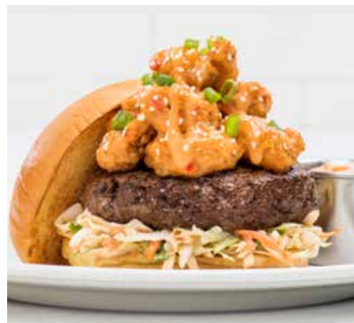
SURF & TURF BURGER

Two smashed & stacked burgers seasoned and seared medium-well, with Monterey Jack cheese, pickled jalapeños, leaf lettuce, vine-ripened tomato, and spicy mayonnaise.* Δ £18.95 (1478 cal)