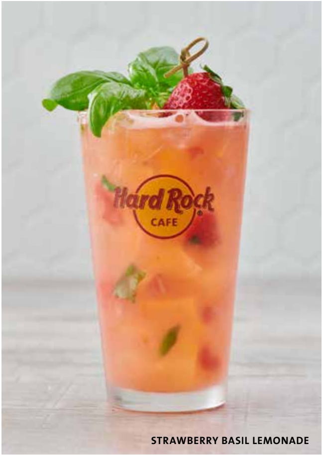
STRAWBERRY BASIL LEMONADE

2000 calories a day is used for general nutrition advice, but calorie needs vary. Additional nutritional information is available upon request.