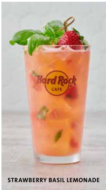
STRAWBERRY BASIL LEMONADE

A refreshing lemonade muddled with fresh strawberries and basil. £7.60 (137 cal)