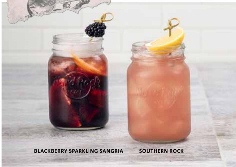
BLACKBERRY SPARKLING SANGRIA