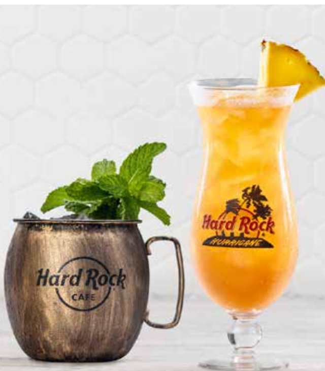
RHYTHM & ROSÉ MULE

Bacardi Superior Rum, Malibu Coconut, crème de banane, grenadine, pineapple and orange juice. £10.55