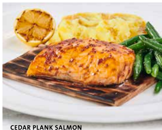
CEDAR PLANK SALMON

Half chicken, brined then basted with our house-made barbecue sauce and roasted until fork-tender. Served with seasoned fries, coleslaw and ranch-style beans.* £22.95 (1340 cal)