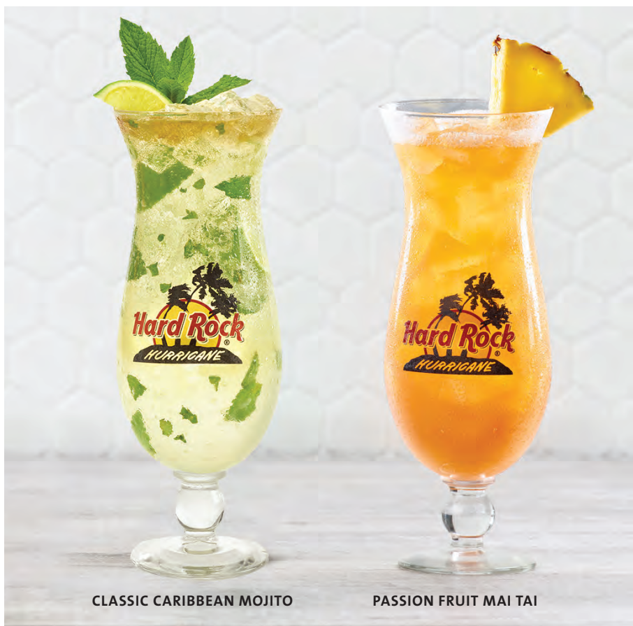
CLASSIC CARIBBEAN MOJITO