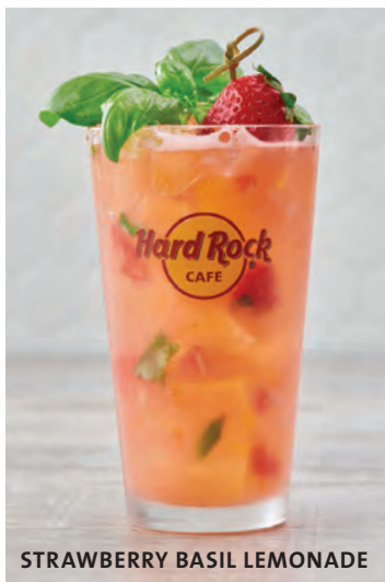
STRAWBERRY BASIL LEMONADE

Häagen-Dazs vanilla ice cream blended with white chocolate and Oreo cookies, finished with fresh whipped cream and a sugar-dusted brownie square. RM45 nett