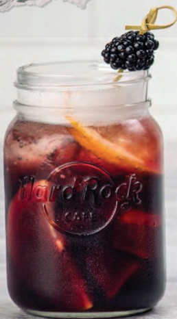
BLACKBERRY SPARKLING SANGRIA