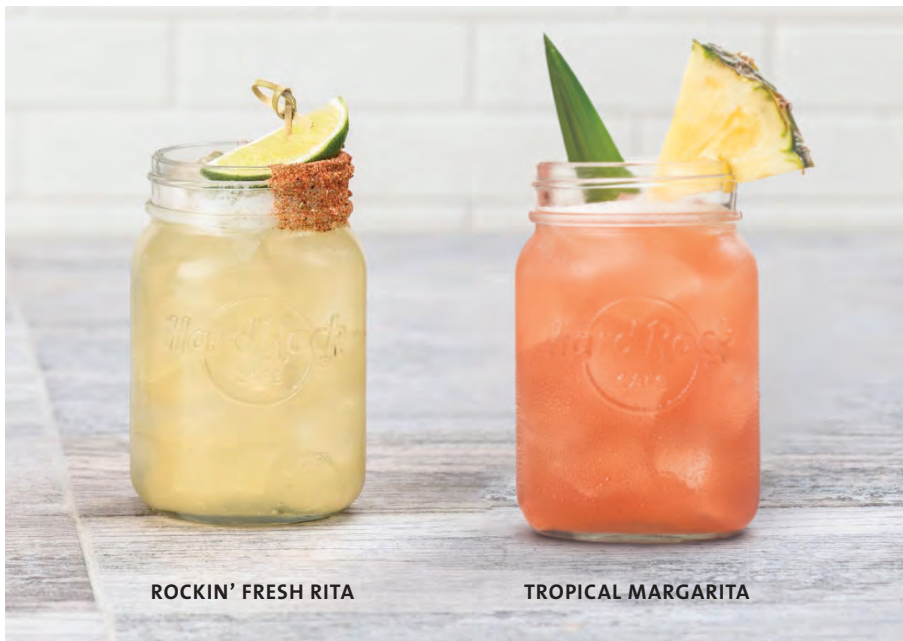
ROCKIN' FRESH RITA

ABSOLUT Vodka, Bacardi Superior Rum, Bombay Sapphire Gin and Blue Curaçao with sweet & sour and topped with Red Bull®. RM55 nett | RM117 nett