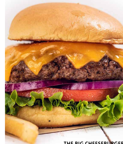
THE BIG CHEESEBURGER

The North East's take on the local Legendary burger, served with Northumbria smoked cheese from Blagdon, 'Newcy Brown' onion jam, Hand-pulled smoked BBQ pork, and Chipotle aioli. All served in a toasted brioche bun with leaf lettuce. 1364 kcal, £19.25