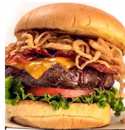
BBQ BACON CHEESEBURGER