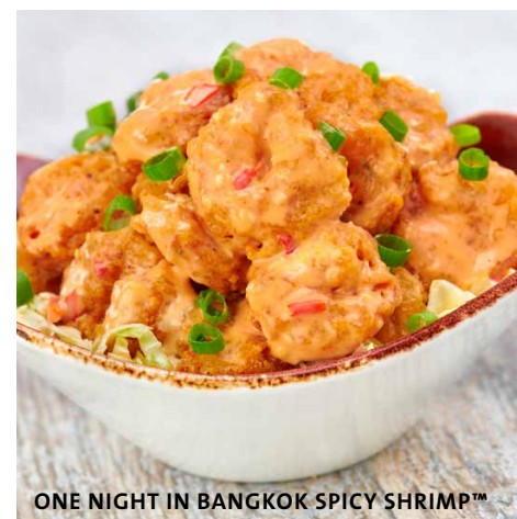
ONE NIGHT IN BANGKOK SPICY SHRIMP™