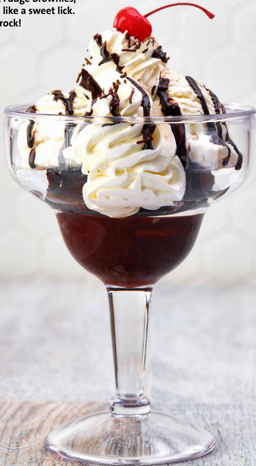
HOT FUDGE BROWNIE

From Milkshakes to Hot Fudge Brownies, nothing says rock n' roll like a sweet lick. Cheers to desserts that rock!