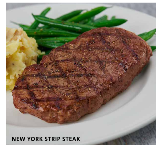
NEW YORK STRIP STEAK