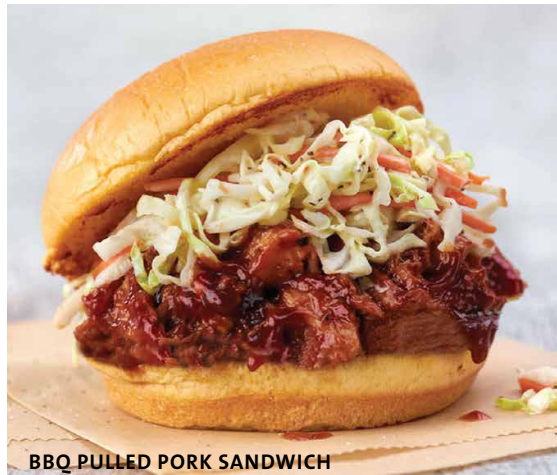
BBQ PULLED PORK SANDWICH

Crispy buttermilk-marinated chicken breast with leaf lettuce, vine-ripened tomato and ranch dressing, served on a toasted fresh brioche bun. 1224 kcal £13.95 Spice it up with our classic Buffalo sauce! 1246kcal