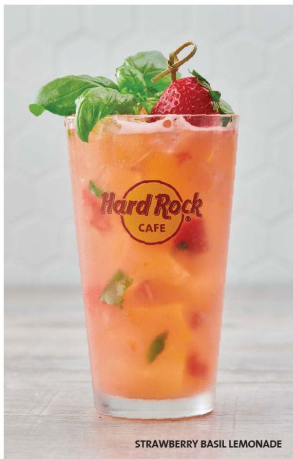
STRAWBERRY BASIL LEMONADE

Vanilla ice cream, white chocolate and Oreo® cookies, with whipped cream. Served in a signature mini-milk jug. RM45