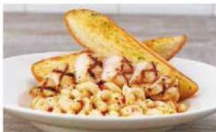
TWISTED MAC, CHICKEN & CHEESE

Grilled free-range chicken breast, sliced and served on cavatappi pasta tossed in a four-cheese sauce blend with diced red peppers.* RM58