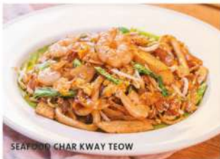
SEAFOOD CHAR KWAY TEOW

Stir-fried flat noodles tossed with bean sprouts, fish cake, free-range egg, prawn, squid, sweet and spicy soya sauce.†* RM35