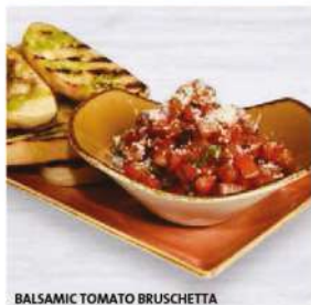
BALSAMIC TOMATO BRUSCHETTA