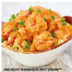
ONE NIGHT IN BANGKOK SPICY SHRIMP™