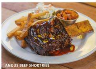
ANGUS BEEF SHORT RIBS

600g Angus Short Ribs seasoned with our signature spice blend, then glazed with our house-made barbecue sauce and grilled to perfection, served with seasoned fries, coleslaw and ranch-style beans.* RM175