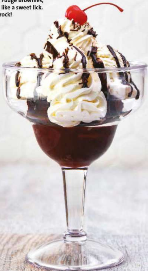
HOT FUDGE BROWNIE

From Milkshakes to Hot Fudge Brownies, nothing says rock n' roll like a sweet lick. Cheers to desserts that rock!