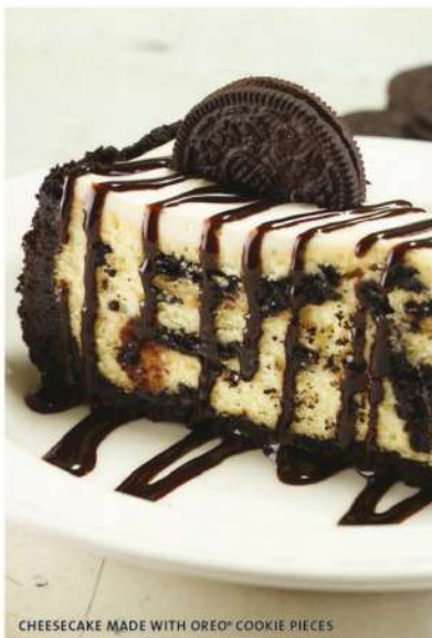
CHEESECAKE MADE WITH OREO® COOKIE PIECES

Your choice of flavors - Chocolate, Strawberry or Vanilla ice cream, blended thick and finished with fresh whipped cream. RM35