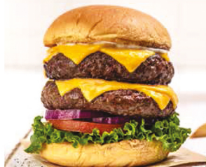
DOUBLE DECKER DOUBLE CHEESEBURGER