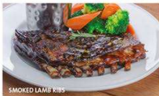
SMOKED LAMB RIBS

360g Lamb Ribs smoked with hickory wood, seasoned with our signature spice blend, then glazed with our house-made barbecue sauce and grilled to perfection. Served with seasoned fries and fresh vegetables.* RM109