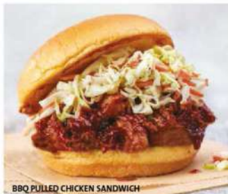
BBQ PULLED CHICKEN SANDWICH

Spice it up with our classic Buffalo sauce RM5!