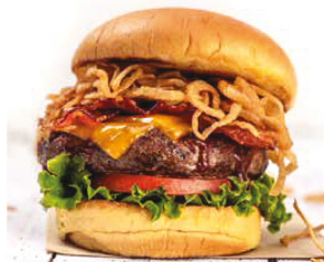
BBQ BACON CHEESEBURGER

Our signature steak burger topped with One Night in Bangkok Spicy Shrimp™ on a bed of creamy coleslaw and served with our signature steak sauce on the side.* RM75