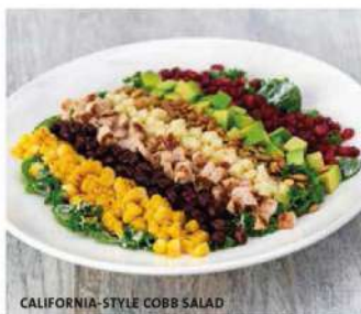
CALIFORNIA-STYLE COBB SALAD

Fajita-spiced free-range chicken, quinoa corn salad, pico de gallo, seasoned black beans and red cabbage served on mixed greens tossed in guacamole ranch dressing.* RM55