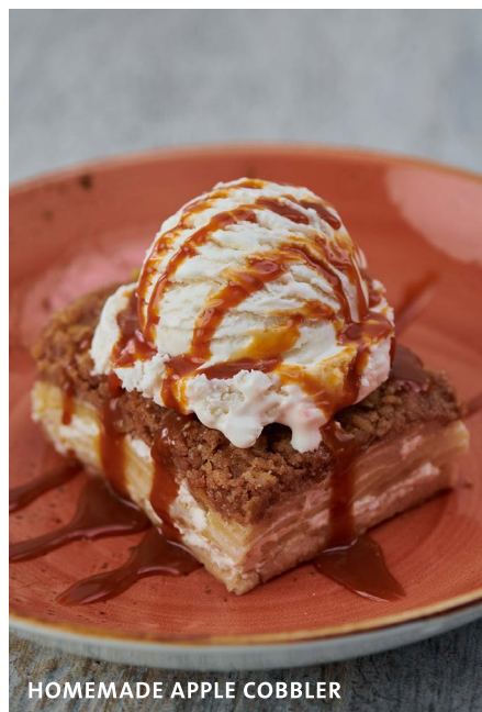
HOMEMADE APPLE COBBLER

Choose from vanilla or chocolate. Small €4.50 Large €5.95