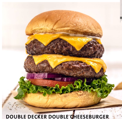
DOUBLE DECKER DOUBLE CHEESEBURGER