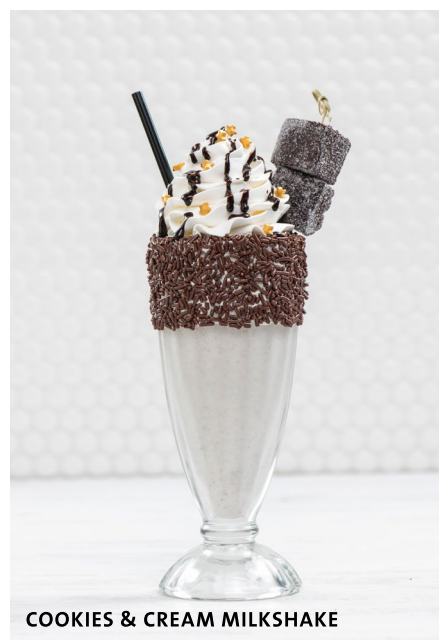
COOKIES & CREAM MILKSHAKE

Your choice of Madagascar vanilla bean or rich chocolate ice cream blended thick and finished with fresh whipped cream. €4.90