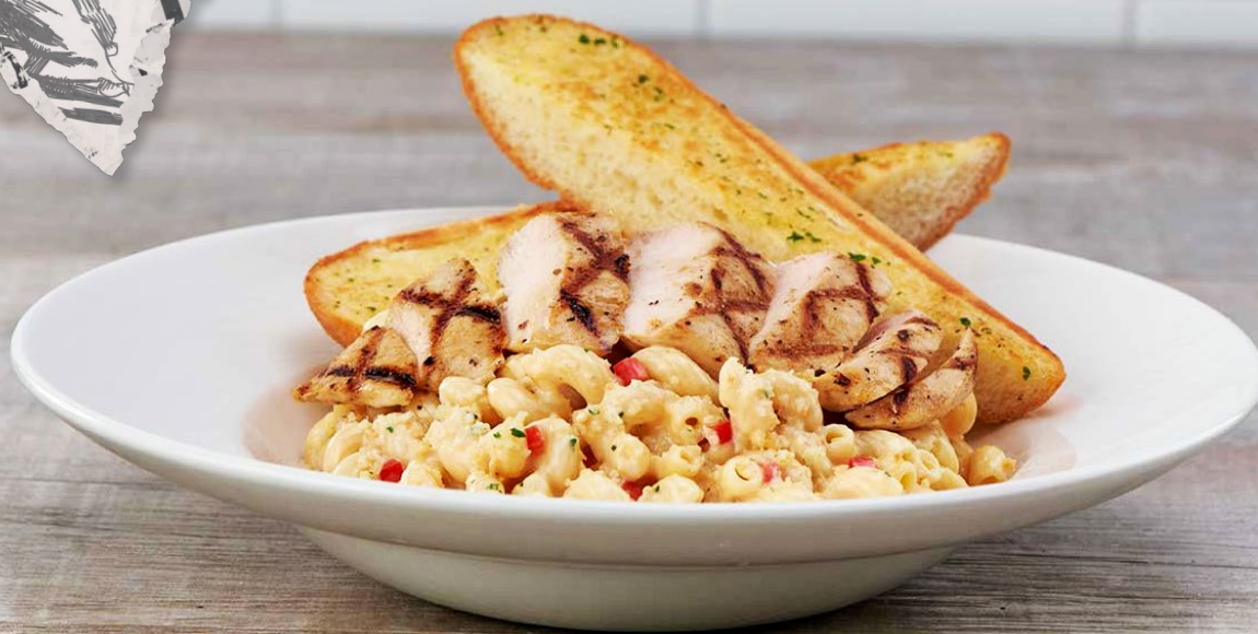
TWISTED MAC, CHICKEN & CHEESE

We hold allergy information for all menu items, please speak to your server for further details. If you suffer from a food allergy, please ensure that your server is aware at the time of order. † Contains nuts or seeds. * These items contain (or may contain) raw or undercooked ingredients. Consuming raw or undercooked hamburgers, meats, poultry, seafood, shellfish or eggs may increase your risk of foodborne illness, especially if you have certain medical conditions. # (GF) Gluten-Free, (V) Vegetarian, (VG) Vegan. Δ These dishes can be modified for a Gluten-Free, Vegetarian or Vegan option. (GF-A) Gluten-Free available, (V-A) Vegetarian available, (VG-A) Vegan available. Please talk to your server to arrange any dietary needs.