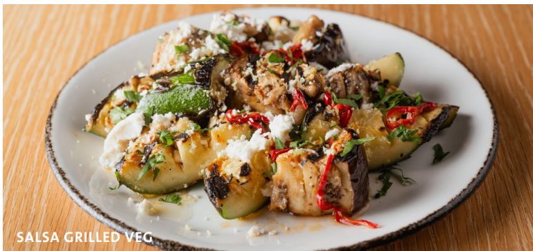
SALSA GRILLED VEG

We hold allergy information for all menu items, please speak to your server for further details. If you suffer from a food allergy, please ensure that your server is aware at the time of order. † Contains nuts or seeds. * These items contain (or may contain) raw or undercooked ingredients. Consuming raw or undercooked hamburgers, meats, poultry, seafood, shellfish or eggs may increase your risk of foodborne illness, especially if you have certain medical conditions. # (GF) Gluten-Free, (V) Vegetarian, (VG) Vegan. Δ These dishes can be modified for a Gluten-Free, Vegetarian or Vegan option. (GF-A) Gluten-Free available, (V-A) Vegetarian available, (VG-A) Vegan available. Please talk to your server to arrange any dietary needs.