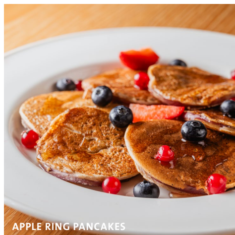
APPLE RING PANCAKES