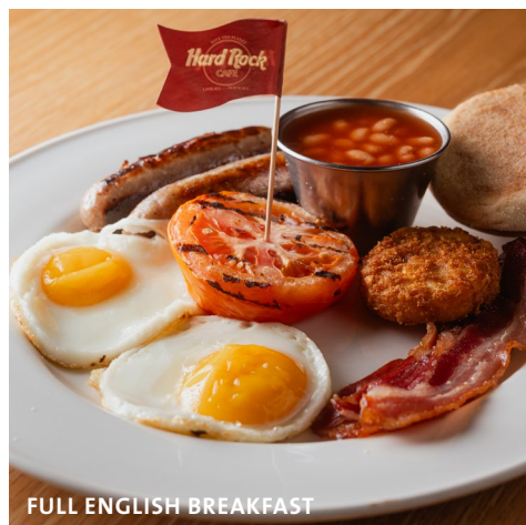
FULL ENGLISH BREAKFAST