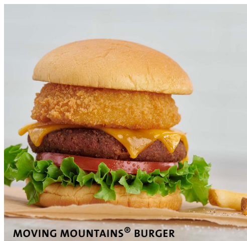
MOVING MOUNTAINS® BURGER