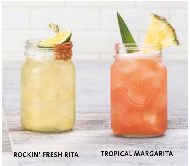
ROCKIN' FRESH RITA

A NYC classic originating in the 1800s. Bourbon, Sweet Vermouth, cherry bitters and finished with a cherry garnish. €8.75