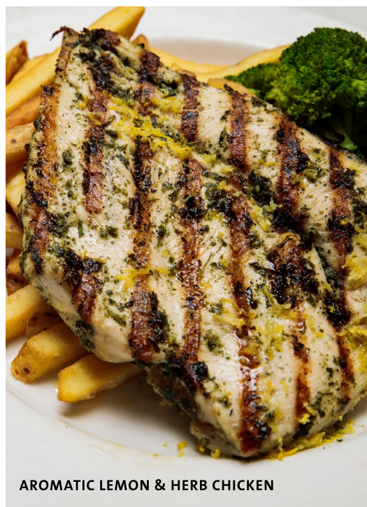
AROMATIC LEMON & HERB CHICKEN

A boneless 227g chicken breast, grilled & marinated with french herbs, garlic, lemon zest & pure olive oil. Served with seasoned fries, seasonal vegetables & sautéed mushrooms. €16.95