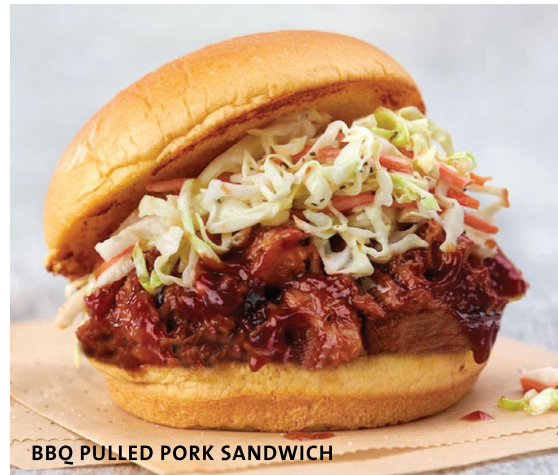
BBQ PULLED PORK SANDWICH

Grilled chicken with melted Monterey Jack cheese, smoked bacon, leaf lettuce and vine-ripened tomato, served on a toasted fresh brioche bun with honey mustard sauce. €14.50