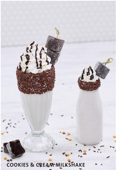
COOKIES & CREAM MILKSHAKE

We hold allergy information for all menu items, please speak to your server for further details. If you suffer from a food allergy, please ensure that your server is aware at time of order. † Contains nuts or seeds.