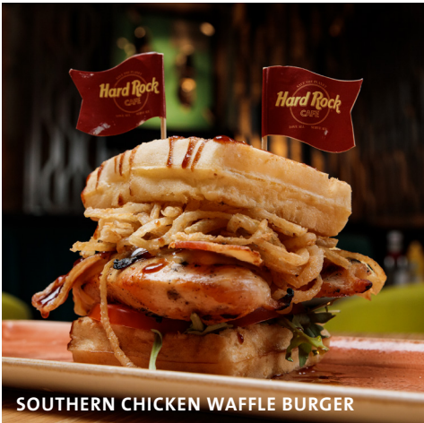
SOUTHERN CHICKEN WAFFLE BURGER