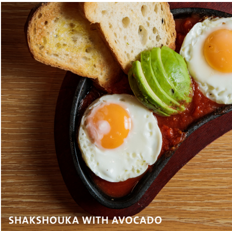
SHAKSHOUKA WITH AVOCADO

We hold allergy information for all menu items, please speak to your server for further details. If you suffer from a food allergy, please ensure that your server is aware at the time of order. † Contains nuts or seeds. * These items contain (or may contain) raw or undercooked ingredients. Consuming raw or undercooked hamburgers, meats, poultry, seafood, shellfish or eggs may increase your risk of foodborne illness, especially if you have certain medical conditions.