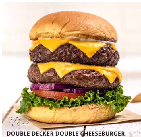
DOUBLE DECKER DOUBLE CHEESEBURGER