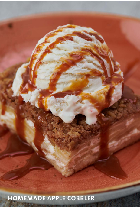
HOMEMADE APPLE COBBLER

Your choice of Madagascar vanilla bean or rich chocolate ice cream blended thick and finished with fresh whipped cream. €4.90