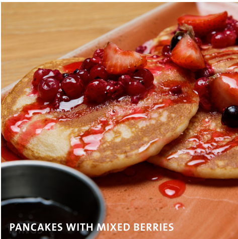
PANCAKES WITH MIXED BERRIES