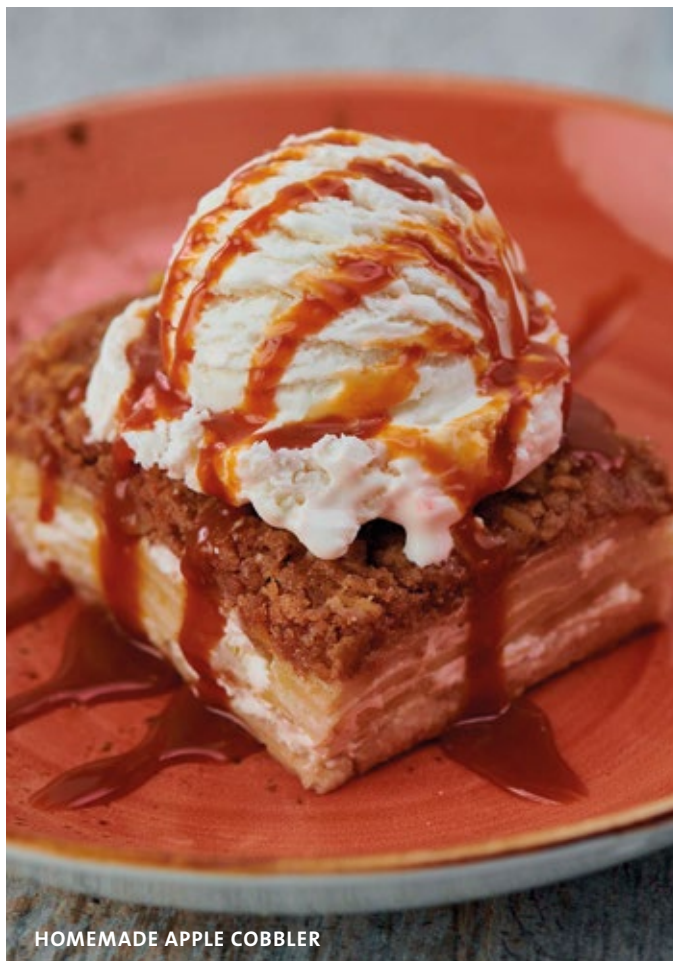
HOMEMADE APPLE COBBLER

Choose from vanilla or chocolate. # Small 4.25€ Large 6.50€