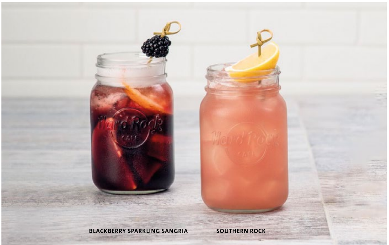
BLACKBERRY SPARKLING SANGRIA

Vodka, Kahlúa coffee liqueur, fresh brewed espresso shaken until frothy and chilled. 9.75€