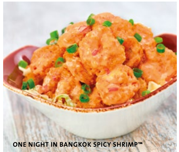
ONE NIGHT IN BANGKOK SPICY SHRIMP™

Chili-dusted grilled tortilla, filled with pineapple and your choice of grilled chicken or pulled pork tossed in our sweet & spicy tangy sauce with melted Jack and Cheddar cheese. Served with shredded lettuce, fresh pico de gallo, guacamole, and sour cream. 12.55€