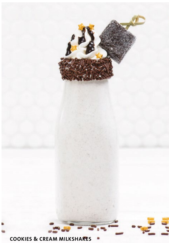
COOKIES & CREAM MILKSHAKES

Your choice of Madagascar vanilla bean or rich chocolate ice cream blended thick and finished with fresh whipped cream. 7.25€