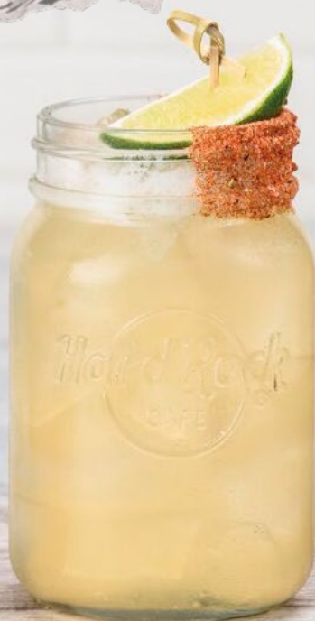
ROCKIN' FRESH RITA