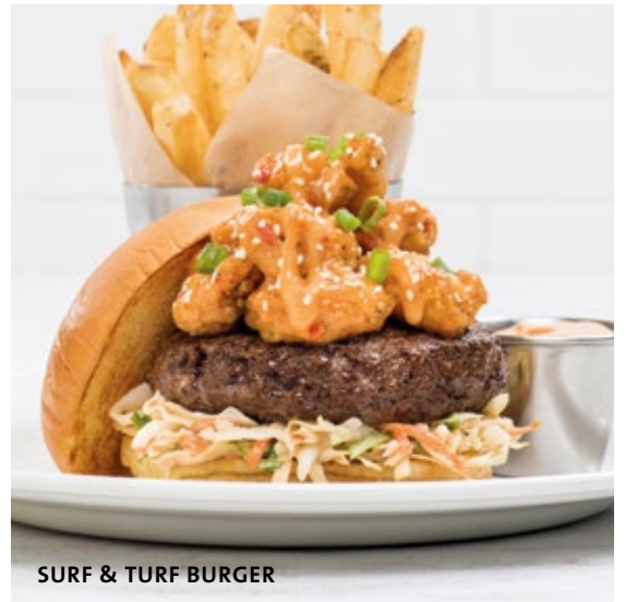
SURF & TURF BURGER

Our signature steak burger topped with One Night in Bangkok Spicy Shrimp™ on a bed of spicy slaw and served with our signature chipotle aioli on the side.* Δ 19.25€