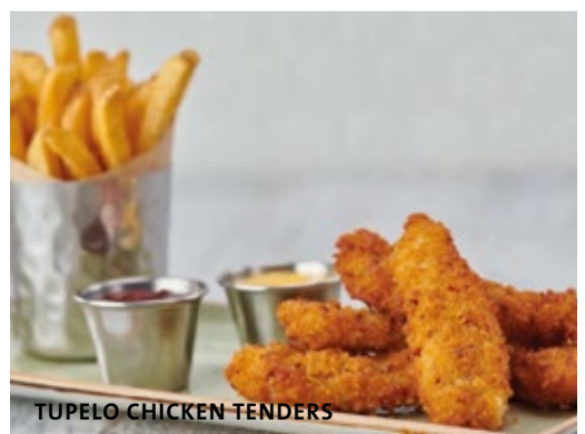
TUPELO CHICKEN TENDERS

Crispy chicken tenders served with seasoned fries, honey mustard and our house-made barbecue sauce. 14.75€