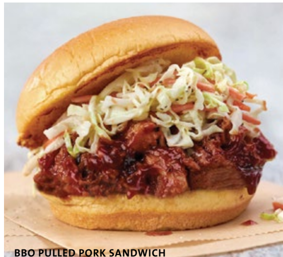
BBQ PULLED PORK SANDWICH

Spice it up with our classic Buffalo sauce upon request!