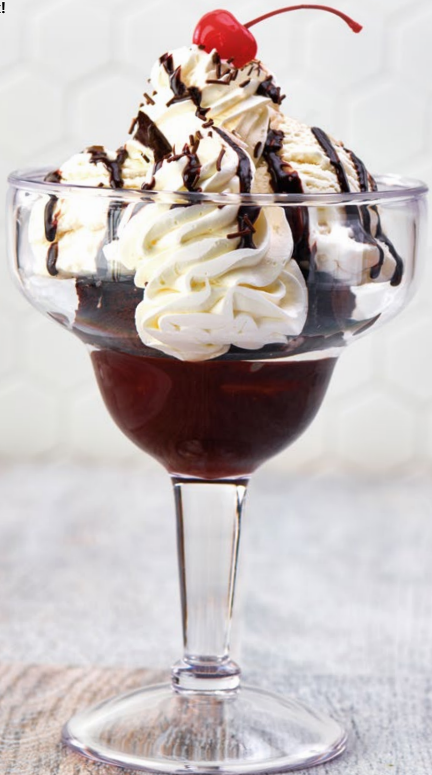
HOT FUDGE BROWNIE

From Milkshakes to Hot Fudge Brownies, nothing says rock n' roll like a sweet lick. Cheers to desserts that rock!