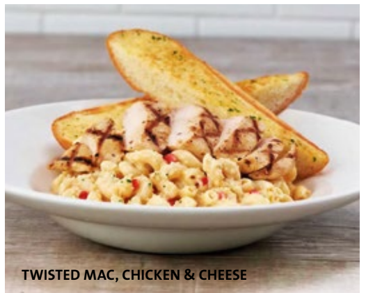
TWISTED MAC, CHICKEN & CHEESE

Grilled chicken breast, sliced and served on cavatappi pasta tossed in a four-cheese sauce blend with diced red peppers. Served with garlic bread. 16.25€