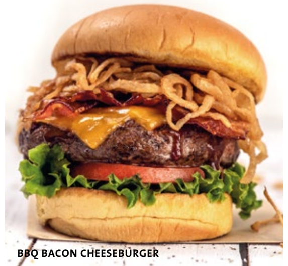
BBQ BACON CHEESEBURGER