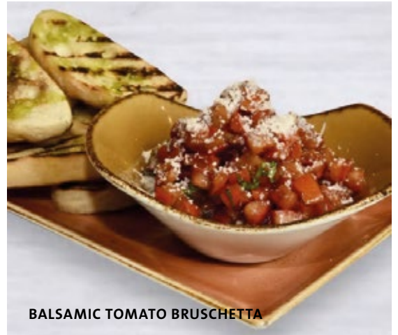
BALSAMIC TOMATO BRUSCHETTA