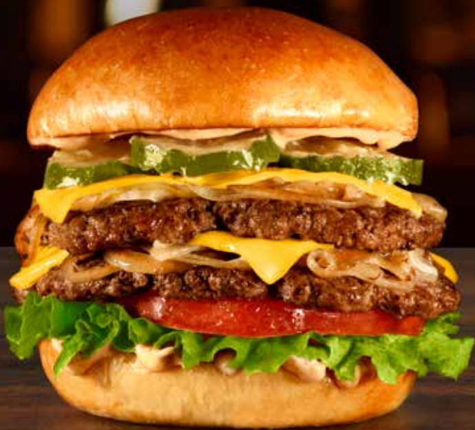
The Classic Smashed Burger