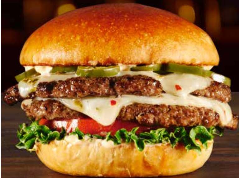
Spicy Diablo Smashed Burger