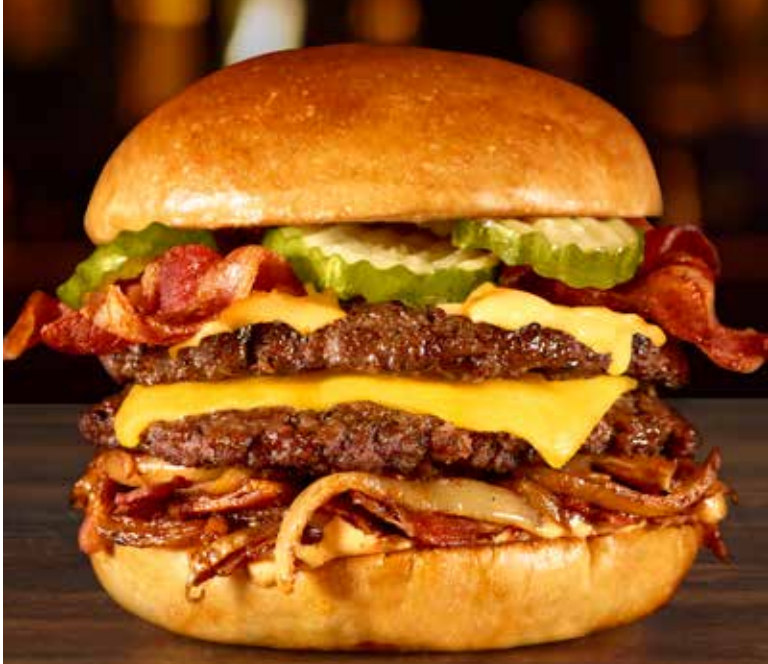
Legendary® Smashed Burger