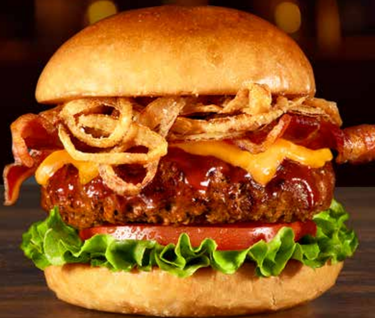
BBQ Bacon Burger