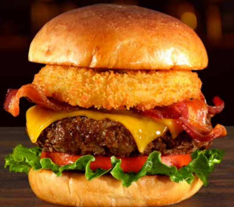
Original Legendary® Burger