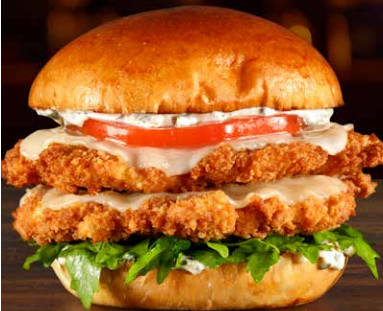
Messi Chicken Sandwich