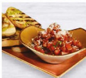
BALSAMIC TOMATO BRUSCHETTA