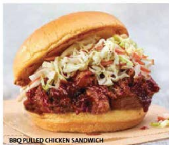
BBQ PULLED CHICKEN SANDWICH

Spice it up with our classic Buffalo sauce RM5!