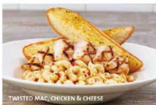
TWISTED MAC, CHICKEN & CHEESE

Crispy free-range chicken tenders served with seasoned fries, honey mustard and our house-made barbecue sauce.* RM48