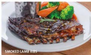
SMOKED LAMB RIBS

360g Lamb Ribs smoked with hickory wood, seasoned with our signature spice blend, then glazed with our house-made barbecue sauce and grilled to perfection. Served with seasoned fries and fresh vegetables.* RM109