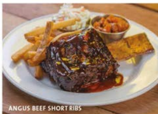
ANGUS BEEF SHORT RIBS

600g Angus Short Ribs seasoned with our signature spice blend, then glazed with our house-made barbecue sauce and grilled to perfection, served with seasoned fries, coleslaw and ranch-style beans.* RM175