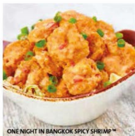
ONE NIGHT IN BANGKOK SPICY SHRIMP™