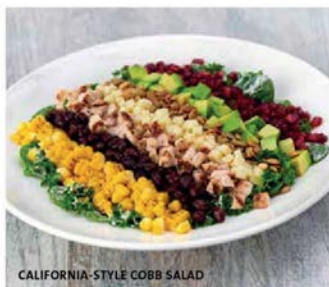
CALIFORNIA-STYLE COBB SALAD

Fajita-spiced free-range chicken, quinoa corn salad, pico de gallo, seasoned black beans and red cabbage served on mixed greens tossed in guacamole ranch dressing.* RM55