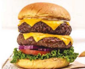
DOUBLE DECKER DOUBLE CHEESEBURGER