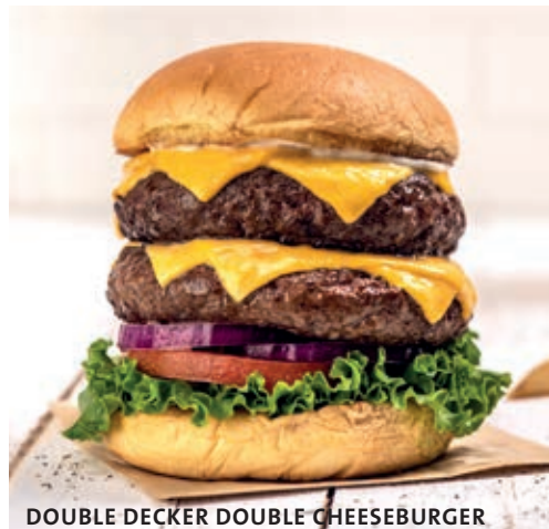
DOUBLE DECKER DOUBLE CHEESEBURGER