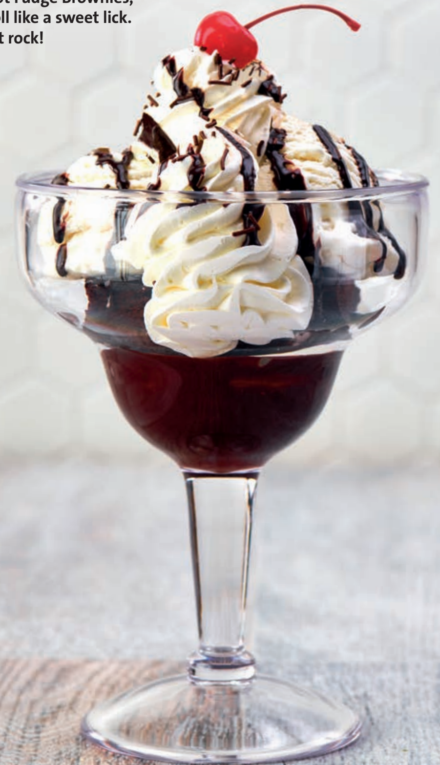
HOT FUDGE BROWNIE

From Milkshakes to Hot Fudge Brownies, nothing says rock n' roll like a sweet lick. Cheers to desserts that rock!