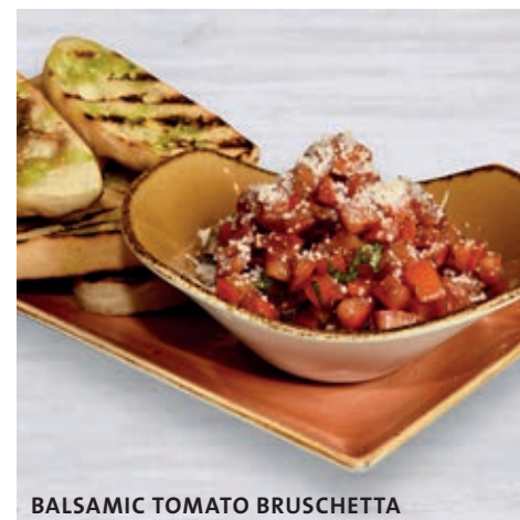
BALSAMIC TOMATO BRUSCHETTA