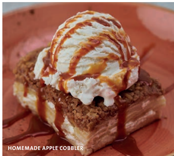
HOMEMADE APPLE COBBLER

Choose from vanilla or chocolate. 14.90 PLN