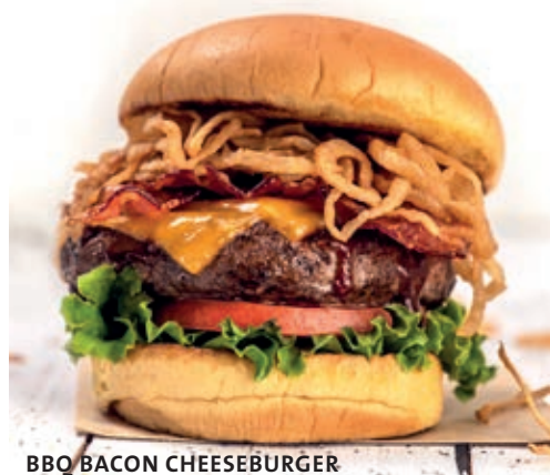
BBQ BACON CHEESEBURGER