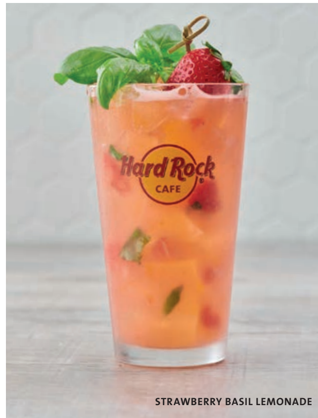
STRAWBERRY BASIL LEMONADE

A tropical blend of mangos, strawberries, pineapple juice, orange juice and house-made Sour Mix topped with Sprite. 29.00 PLN (16 oz)