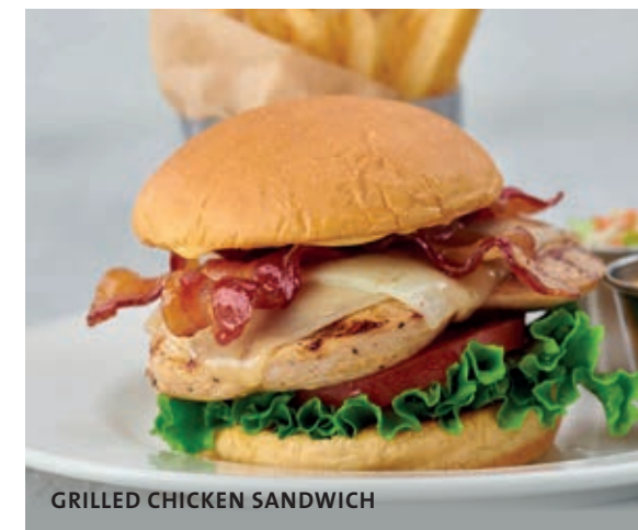
GRILLED CHICKEN SANDWICH

Crispy buttermilk-marinated chicken breast (5 oz) with leaf lettuce, vine-ripened tomato and ranch dressing, served on a toasted fresh brioche bun. 46.90 PLN Spice it up with our classic Buffalo sauce upon request!