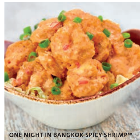
ONE NIGHT IN BANGKOK SPICY SHRIMP™

Chili-dusted grilled tortilla, filled with pineapple and grilled chicken tossed in our sweet & spicy tangy sauce with melted Jack and Cheddar cheese. Served with shredded lettuce, fresh pico de gallo, guacamole, and sour cream. 45.90 PLN