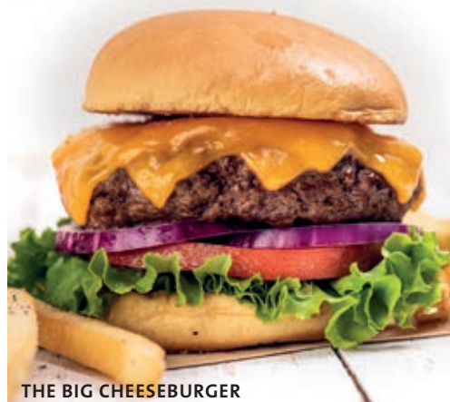
THE BIG CHEESEBURGER

Two smashed & stacked burgers seasoned and seared medium-well, with Monterey Jack cheese, pickled jalapeños, leaf lettuce, vine-ripened tomato, spicy mayonnaise and served with Chipotle Aioli sauce on the side.* 64.90 PLN