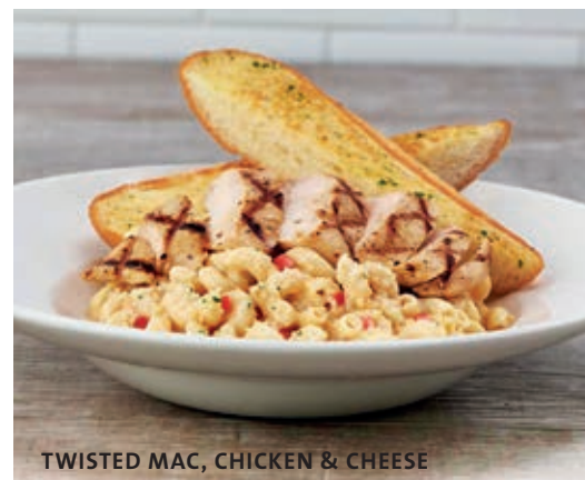
TWISTED MAC, CHICKEN & CHEESE

Beer battered cod fish fried golden brown, served with fries, a citrus spiked tartar sauce and homemade coleslaw. 49.90 PLN