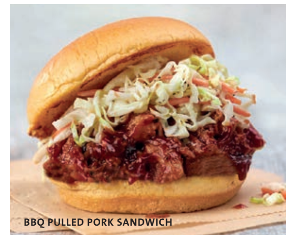
BBQ PULLED PORK SANDWICH