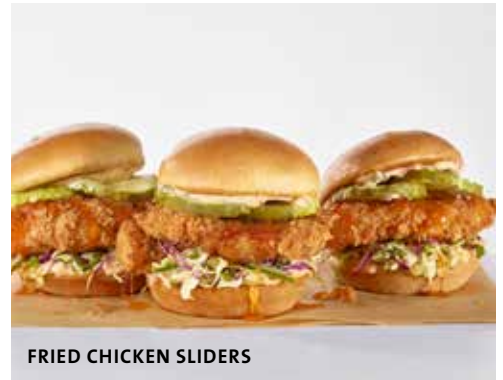
FRIED CHICKEN SLIDERS