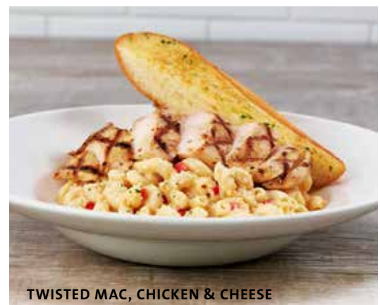
TWISTED MAC, CHICKEN & CHEESE

Crispy chicken tenders served with seasoned fries, honey mustard and our house-made barbecue sauce. € 14,90