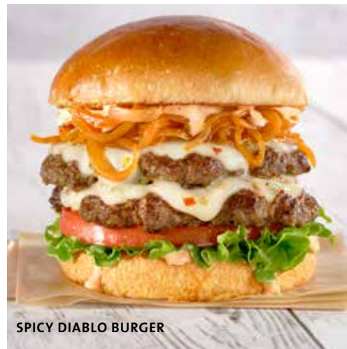
SPICY DIABLO BURGER