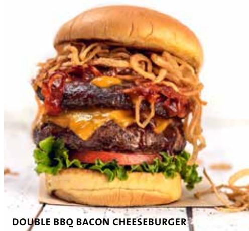
DOUBLE BBQ BACON CHEESEBURGER

*Surcharge when exchanging fries as side