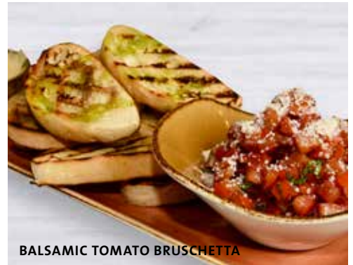
BALSAMIC TOMATO BRUSCHETTA