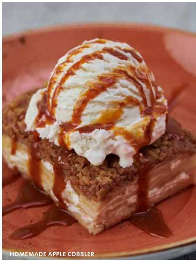
HOMEMADE APPLE COBBLER

Your choice of vanilla or rich chocolate ice cream blended thick and finished with fresh whipped cream.. € 7,90