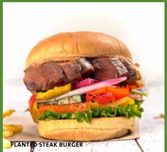
PLANTED STEAK BURGER