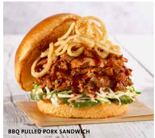
BBQ PULLED PORK SANDWICH

Two smashed burgers with caramelized onions, American cheese, Swiss cheese, Legendary Sauce on toasted white bread, served with seasoned fries. € 18,90