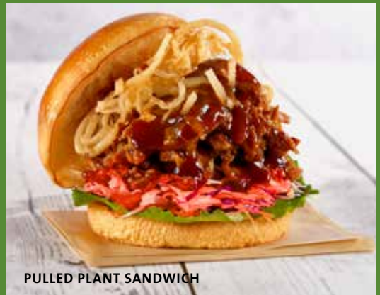
PULLED PLANT SANDWICH