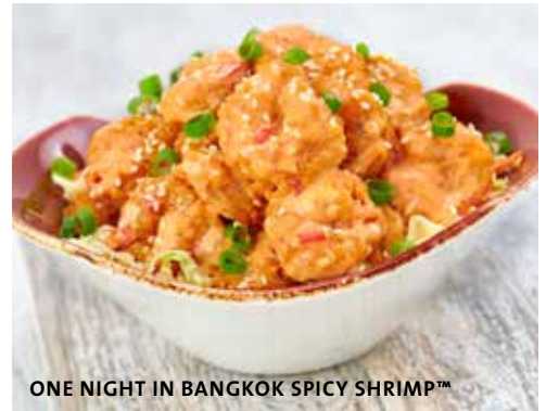
ONE NIGHT IN BANGKOK SPICY SHRIMP™

Roma Tomatoes marinated in balsamic vinegar and fresh basil topped with grated Romano served with a stack of toasted artisan bread and shaved parmesan on the side. € 12,90