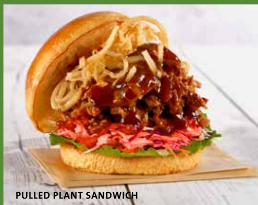
PULLED PLANT SANDWICH