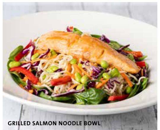
GRILLED SALMON NOODLE BOWL

With grilled steak instead of salmon. € 21,90