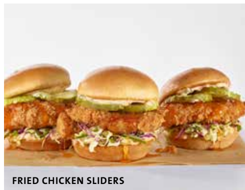
FRIED CHICKEN SLIDERS