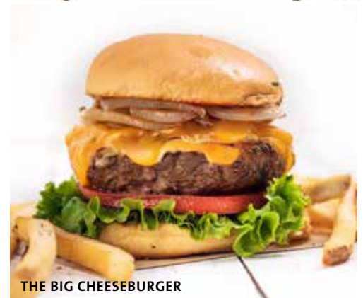
THE BIG CHEESEBURGER