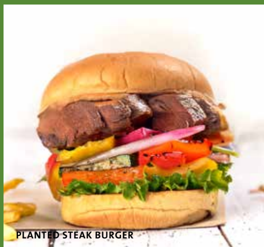
PLANTED STEAK BURGER