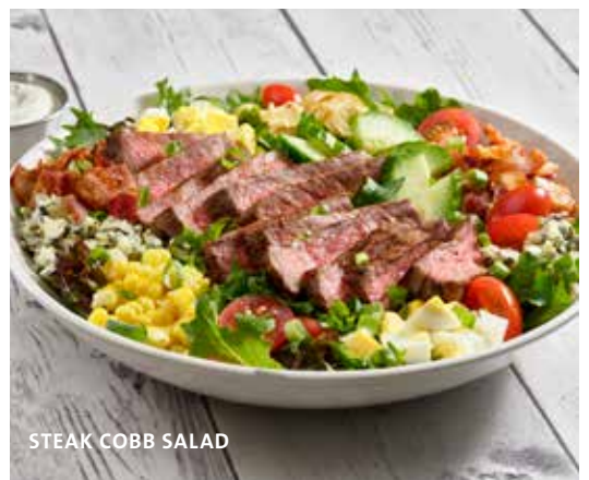
STEAK COBB SALAD

Chicken breast, grilled and sliced with fresh romaine tossed in a classic Caesar dressing, topped with parmesan crisps, croutons and shaved parmesan cheese. € 16,50 Substitute Grilled Salmon € 19,90