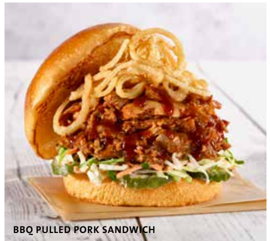
BBQ PULLED PORK SANDWICH

Crispy buttermilk-marinated chicken breast with leaf lettuce, vine-ripened tomato and ranch dressing, served on a fresh toasted bun. Buffalo Style option available. € 16,90