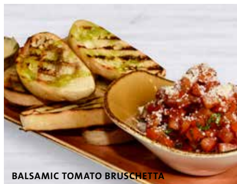
BALSAMIC TOMATO BRUSCHETTA