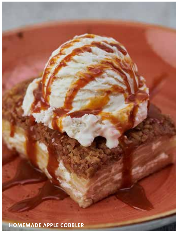
HOMEMADE APPLE COBBLER

Your choice of vanilla or rich chocolate ice cream blended thick and finished with fresh whipped cream.. € 7,90