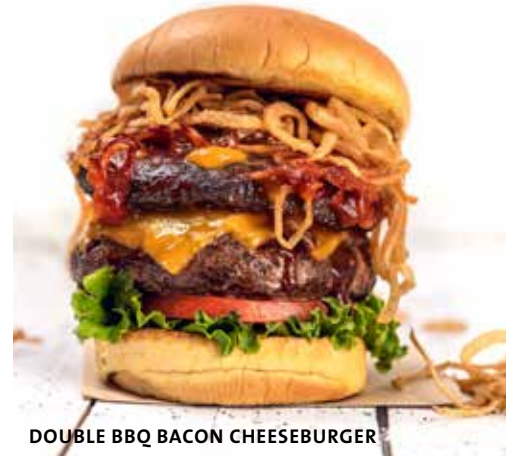
DOUBLE BBQ BACON CHEESEBURGER

*Surcharge when exchanging fries as side