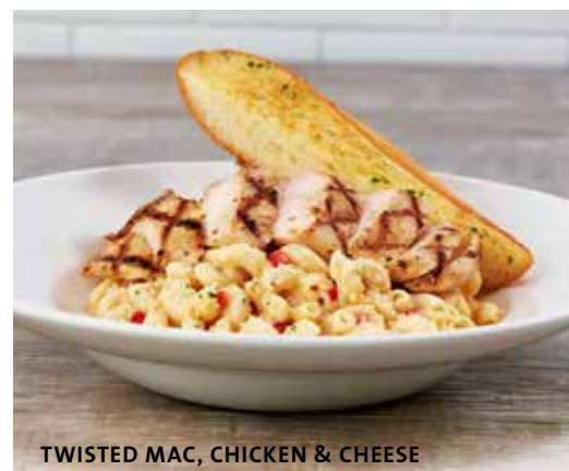
TWISTED MAC, CHICKEN & CHEESE

Crispy chicken tenders served with seasoned fries, honey mustard and our house-made barbecue sauce. € 14,90