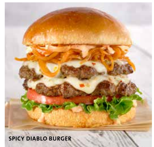
SPICY DIABLO BURGER