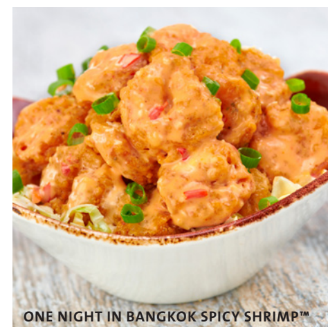
ONE NIGHT IN BANGKOK SPICY SHRIMP™

Chili-dusted grilled tortilla, filled with pineapple and your choice of grilled chicken or pulled pork tossed in our sweet & spicy tangy sauce with melted Jack and Cheddar cheese. Served with shredded lettuce, fresh pico de gallo, guacamole, and sour cream.