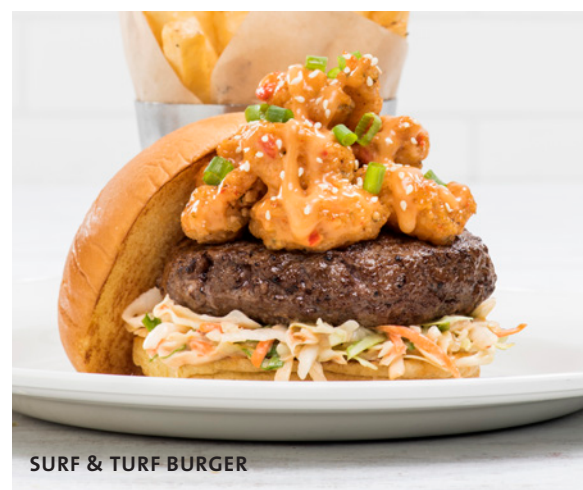
SURF & TURF BURGER