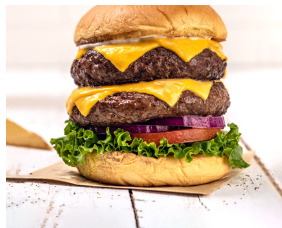
DOUBLE-DECKER DOUBLE CHEESEBURGER