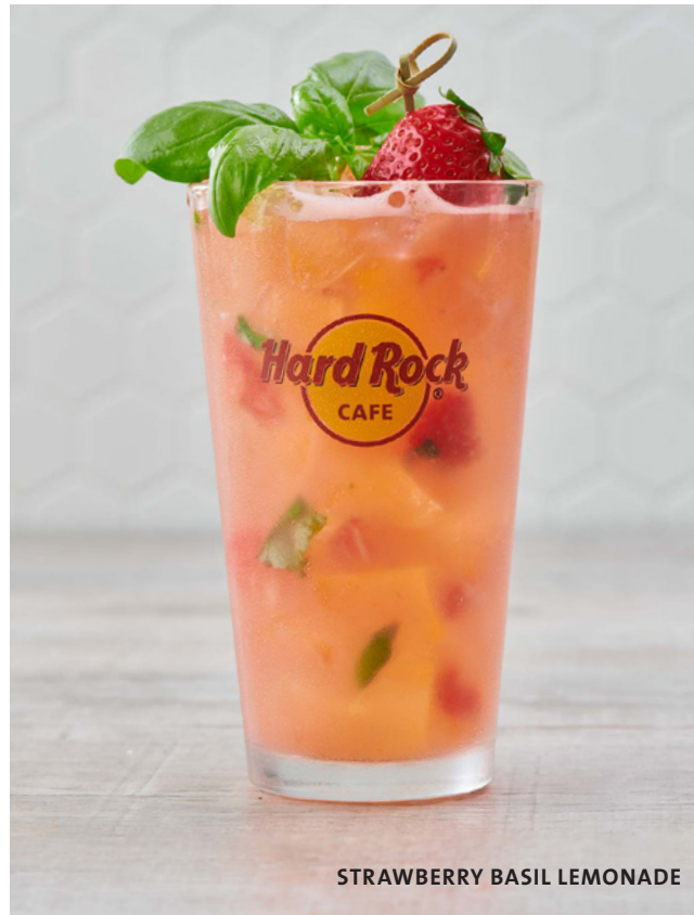
STRAWBERRY BASIL LEMONADE

A tropical blend of mangos, strawberries, pineapple juice, orange juice and house-made Sour Mix topped with Sprite.