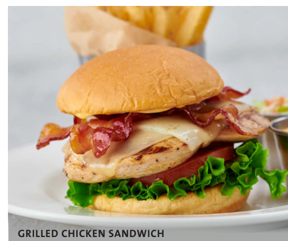
GRILLED CHICKEN SANDWICH

Spice it up with our classic Buffalo sauce upon request!