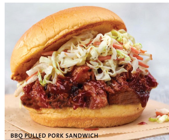
BBQ PULLED PORK SANDWICH