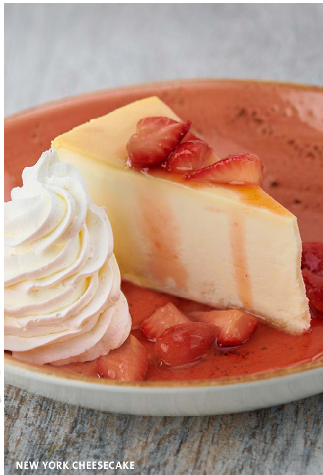
NEW YORK CHEESECAKE