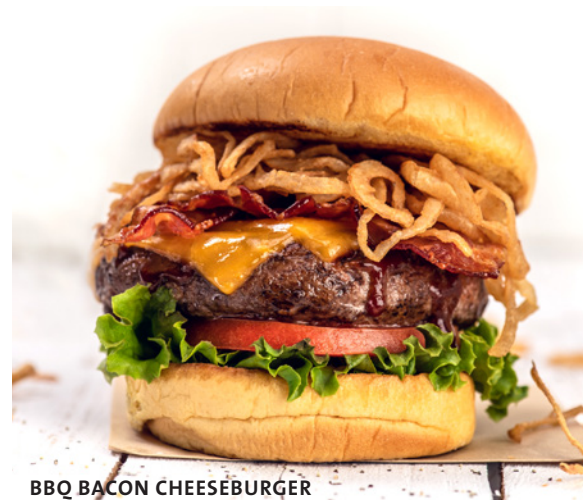
BBQ BACON CHEESEBURGER

Add an upgrade to your Steak Burger Add Smoked Bacon, Upgrade Onion Rings (V, VG-A), Upgrade to Cheese and Smoked Bacon fries (V-A)