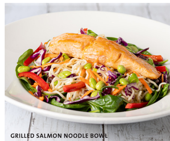
GRILLED SALMON NOODLE BOWL