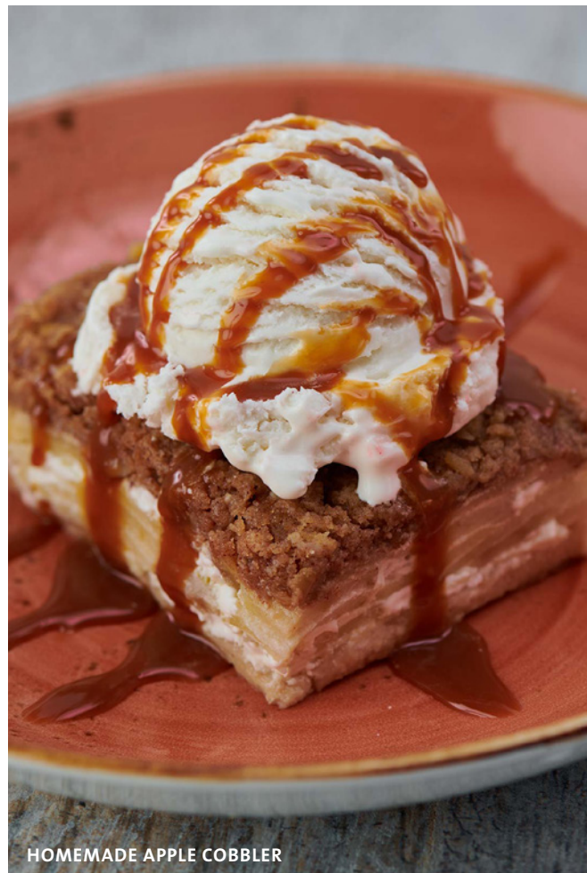
HOMEMADE APPLE COBBLER

Your choice of Madagascar vanilla bean or rich chocolate ice cream blended thick and finished with fresh whipped cream.