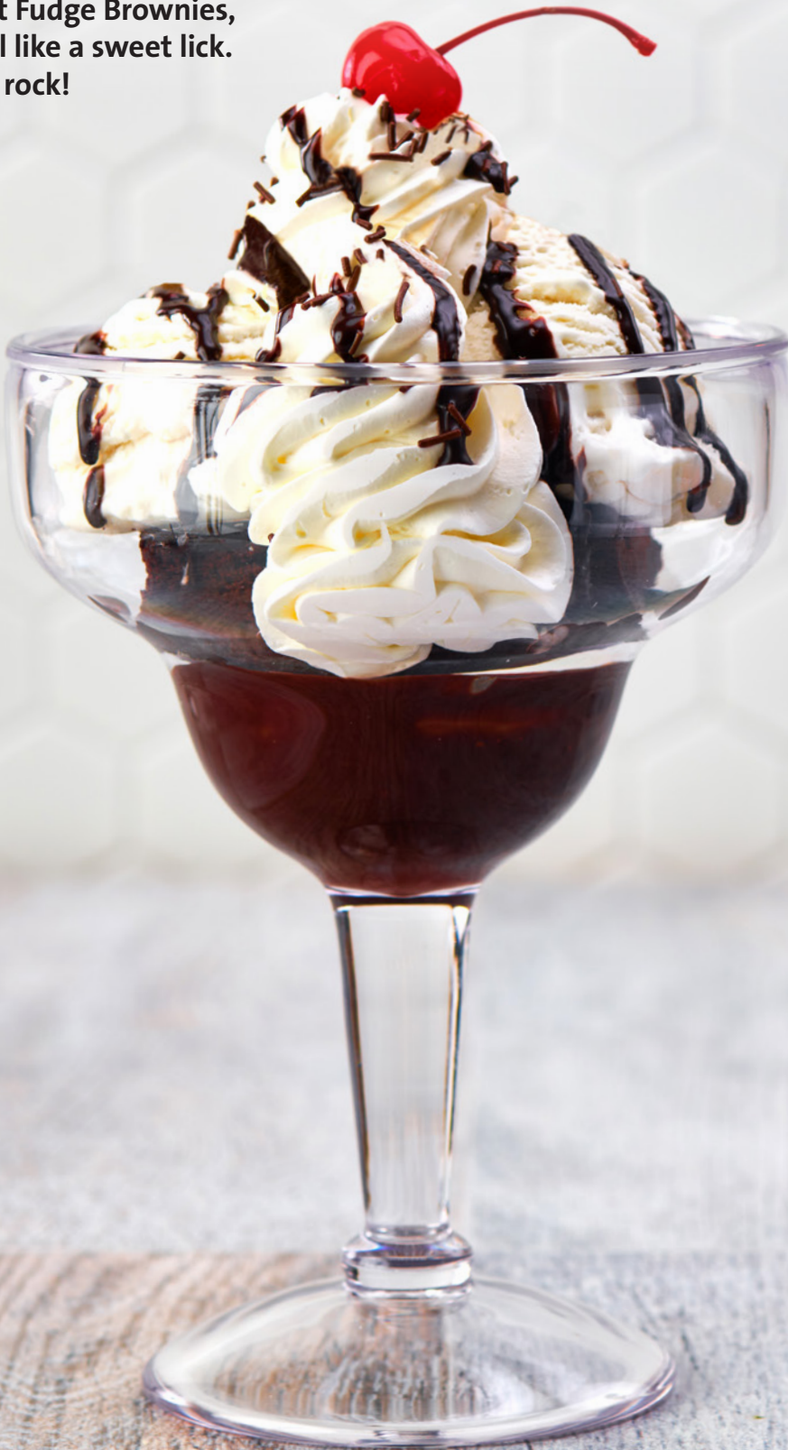
HOT FUDGE BROWNIE

From Milkshakes to Hot Fudge Brownies, nothing says rock n’ roll like a sweet lick. Cheers to desserts that rock!