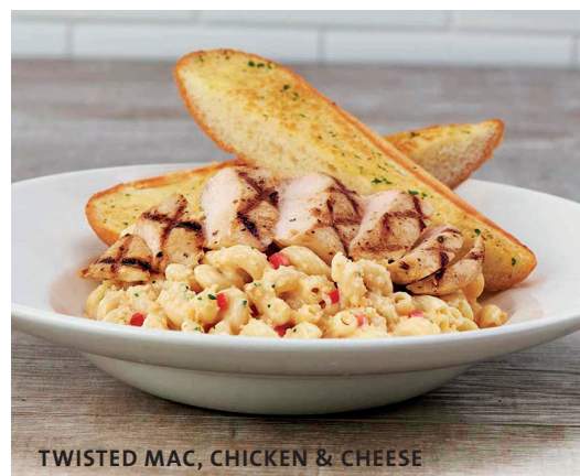
TWISTED MAC, CHICKEN & CHEESE

We hold allergy information for all menu items, please speak to your server for further details. If you suffer from a food allergy, please ensure that your server is aware at the time of order. * Contains nuts or seeds. * These items contain (or may contain) raw or undercooked ingredients. Consuming raw or undercooked hamburgers, meats, poultry, seafood, shellfish or eggs may increase your risk of foodborne illness, especially if you have certain medical conditions. # (V) Vegetarian, (VG) Vegan. (GF-A) Gluten-Free available, may contain traces of gluten, (VG-A) Vegan available. Please talk to your server to arrange any dietary needs.