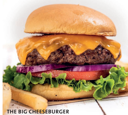
THE BIG CHEESEBURGER

Two smashed & stacked burgers seasoned and seared medium-well, with Monterey Jack cheese, pickled jalapeños, leaf lettuce, vine-ripened tomato, and spicy mayonnaise.* 59.90 PLN