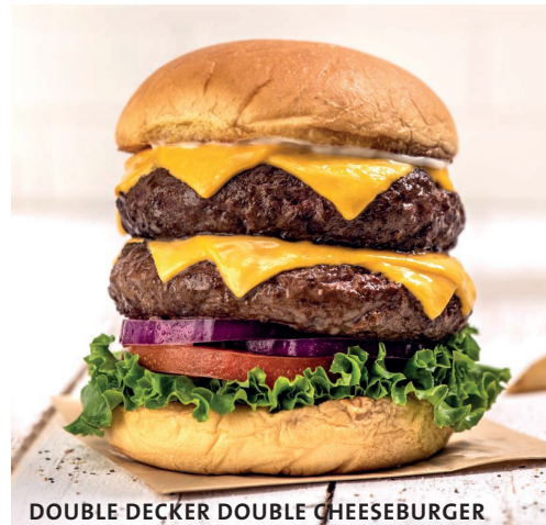
DOUBLE DECKER DOUBLE CHEESEBURGER