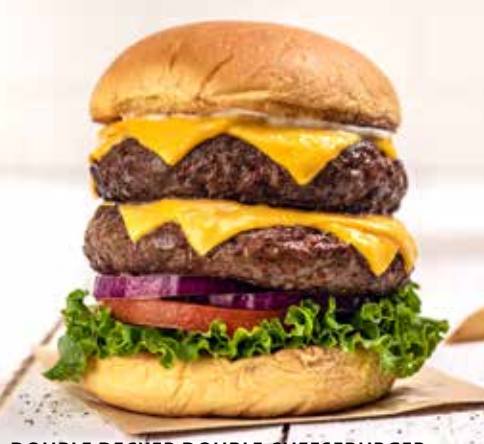
DOUBLE DECKER DOUBLE CHEESEBURGER