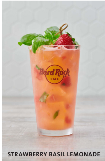
STRAWBERRY BASIL LEMONADE

A tropical blend of mangos, strawberries, pineapple juice, orange juice and house-made sour mix topped with lemon-lime soda. 250