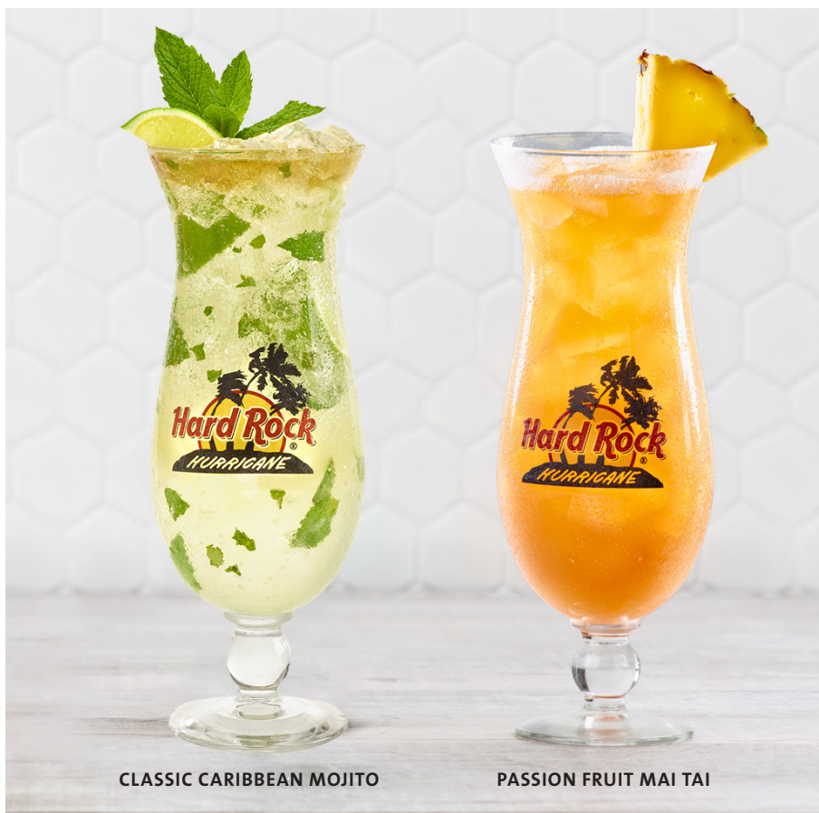
CLASSIC CARIBBEAN MOJITO