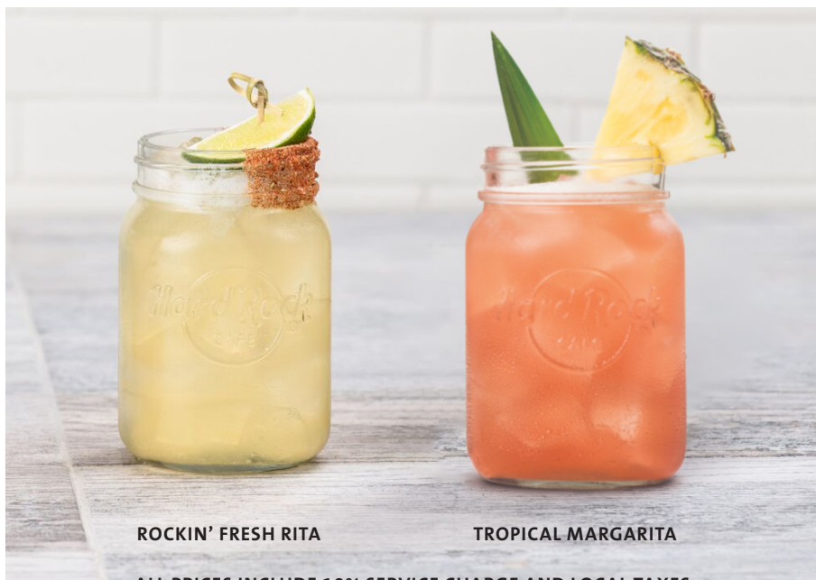
ROCKIN' FRESH RITA

Absolut Vodka, Havana Club 3 Years, Beefeater Gin and Blue Curacao with sweet & sour and topped with Red Bull® 385