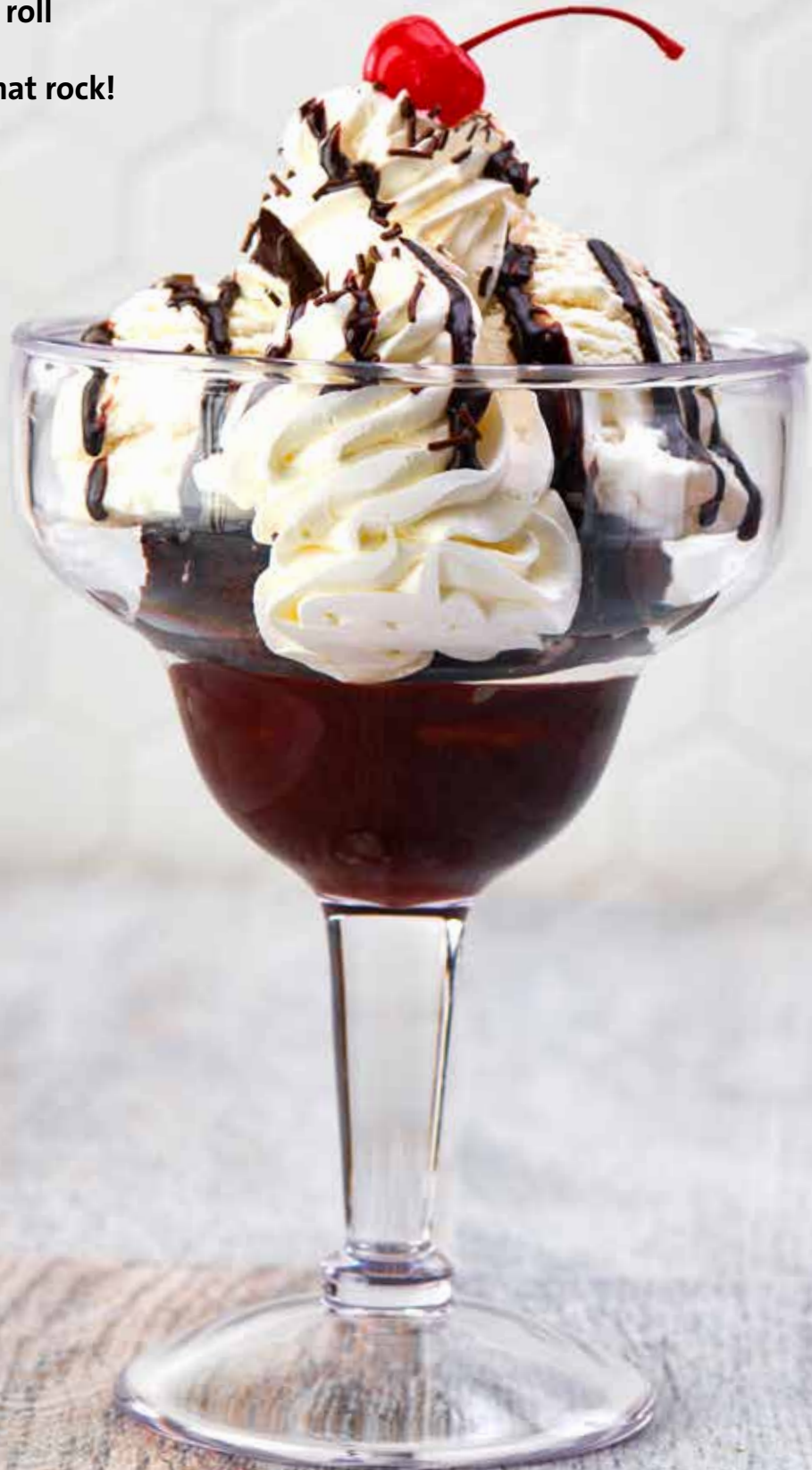
HOT FUDGE BROWNIE

Nothing says rock n' roll like a sweet encore. Cheers to desserts that rock!