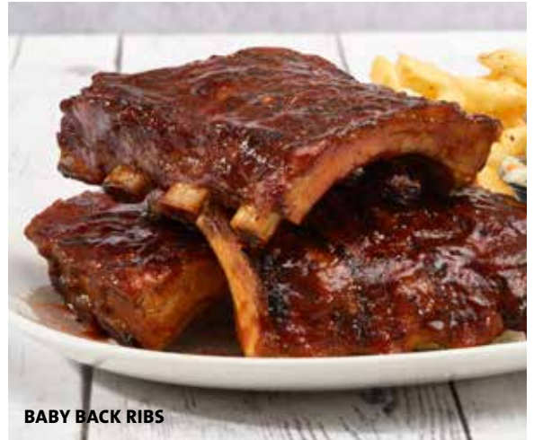
BABY BACK RIBS

Seasoned with our signature spice blend, then glazed with our house-made barbecue sauce and grilled to perfection, served with seasoned fries and coleslaw.* €25.95