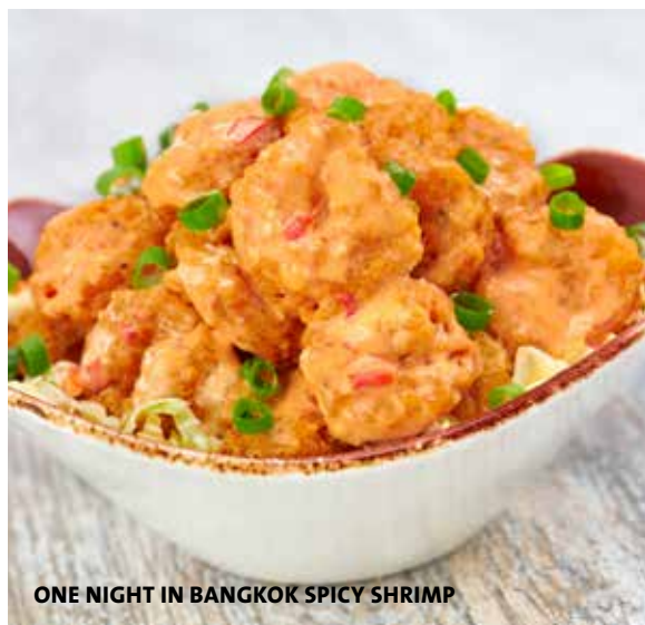
ONE NIGHT IN BANGKOK SPICY SHRIMP

Crispy tortilla chips layered with black beans and queso, topped with fresh pico de gallo, spicy jalapeños, melted Cheddar and Monterey Jack cheese, pickled red onions, green onions and topped with lime crema.* €16.95 Add Guacamole# (GF, VG) €4.95 or Grilled Chicken €6.95 or Grilled Steak* €7.95