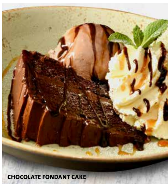
CHOCOLATE FONDANT CAKE

A refreshing lemonade muddled with fresh strawberries and basil. €9.95