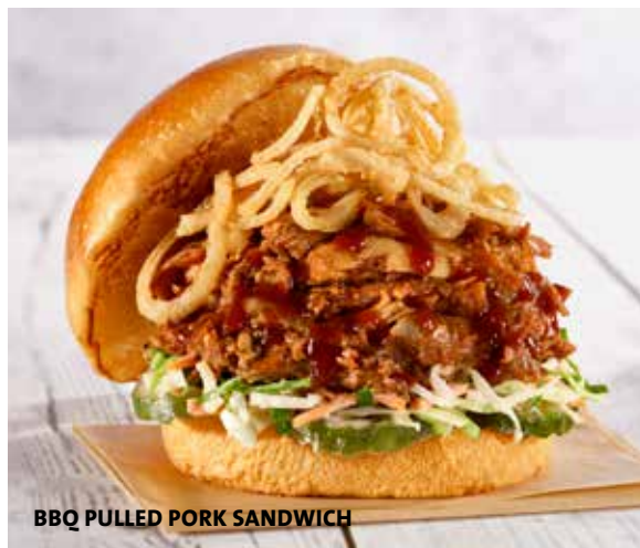
BBQ PULLED PORK SANDWICH

Grilled fresh chicken with melted Monterey Jack cheese, smoked bacon, leaf lettuce and vine-ripened tomato, served on a fresh toasted bun with honey mustard sauce. Δ €18.95