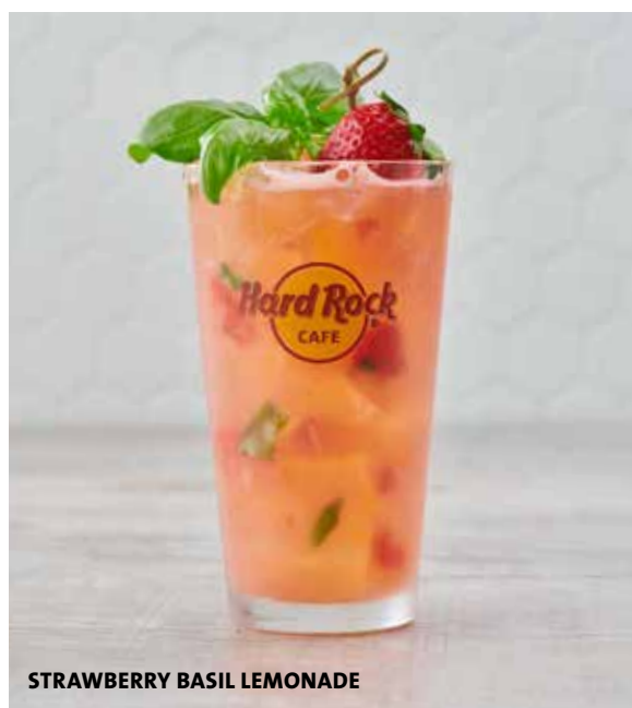
STRAWBERRY BASIL LEMONADE

We hold allergy information for all menu items, please speak to your server for further details. If you suffer from a food allergy, please ensure that your server is aware at the time of order. † Contains nuts or seeds. # (GF) Gluten-Free, (V) Vegetarian, (VG) Vegan. Δ These dishes can be modified for a Gluten-Free, Vegetarian or Vegan option. (GF-A) Gluten-Free available, (V-A) Vegetarian available, (VG-A) Vegan available. Please talk to your server to arrange any dietary needs.