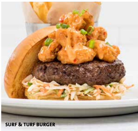
SURF & TURF BURGER

Two smashed & stacked burgers seasoned and seared to medium-well, with Monterey Jack cheese, pickled jalapeños, leaf lettuce, vine-ripened tomato and spicy mayonnaise.* Δ €19.95