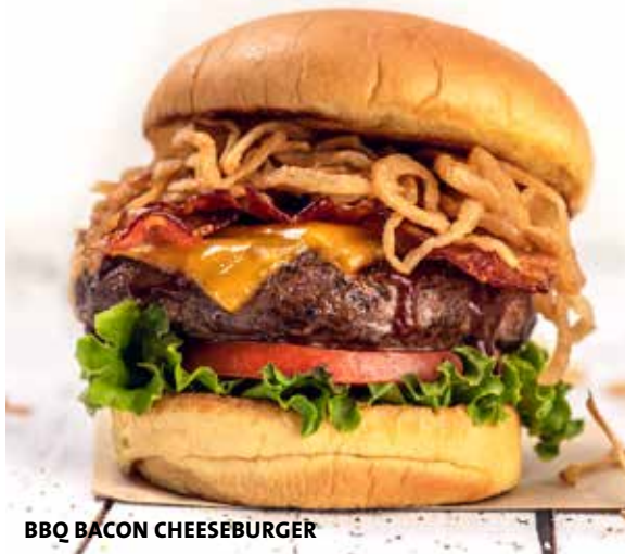
BBQ BACON CHEESEBURGER

Our signature steak burger topped with One Night in Bangkok Spicy Shrimp™ on a bed of spicy slaw.* €22.95