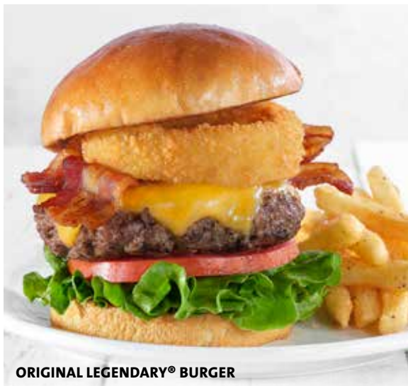
ORIGINAL LEGENDARY® BURGER

Steak burger, with smoked bacon, Cheddar cheese, crispy onion ring, leaf lettuce and vine-ripened tomato.* Δ €19.95