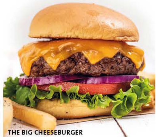
THE BIG CHEESEBURGER

Our signature steak burger topped with One Night in Bangkok Spicy Shrimp™ on a bed of spicy slaw and served with our signature steak sauce on the side.* IDR 199