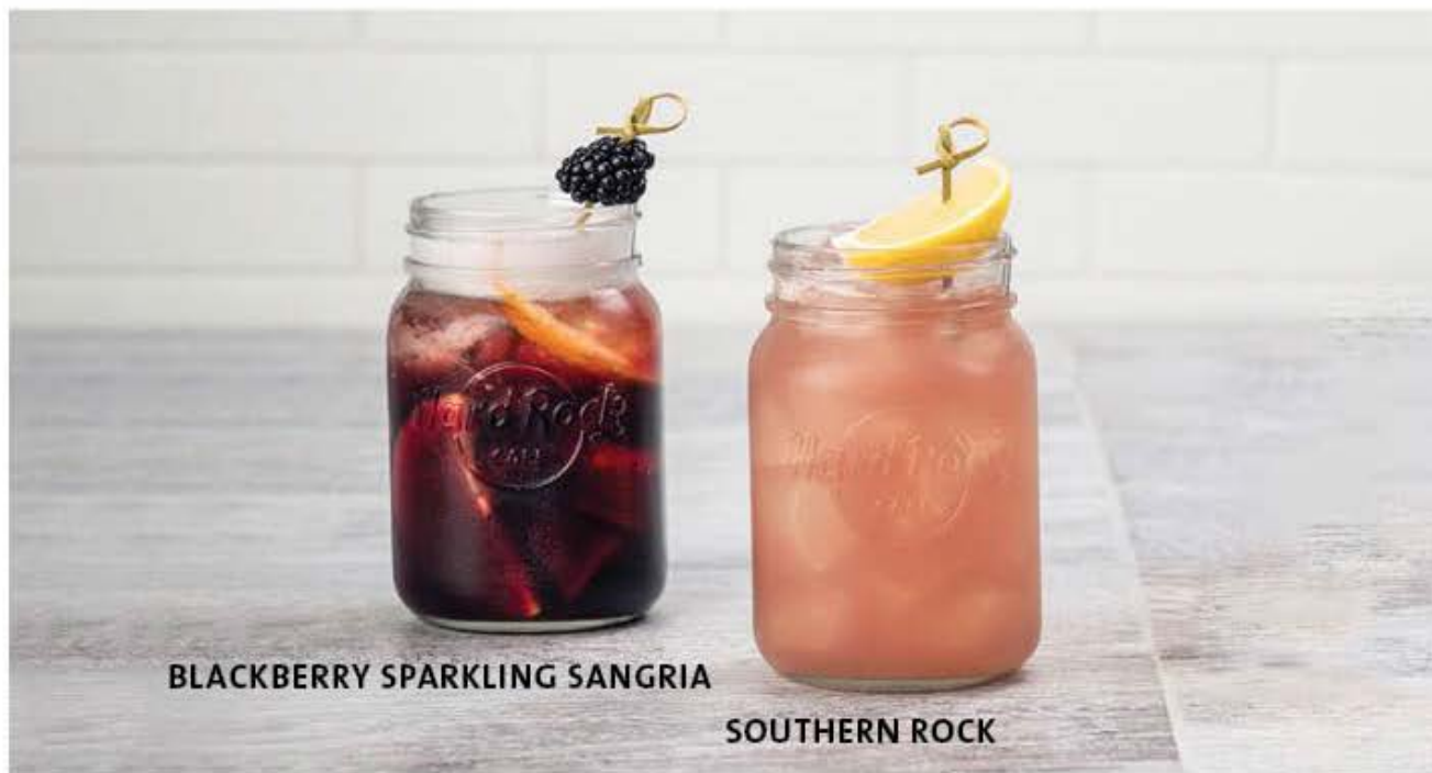
BLACKBERRY SPARKLING SANGRIA

Absolute Vodka, Kahlúa, fresh brewed espresso shaken until frothy and chilled. IDR 129