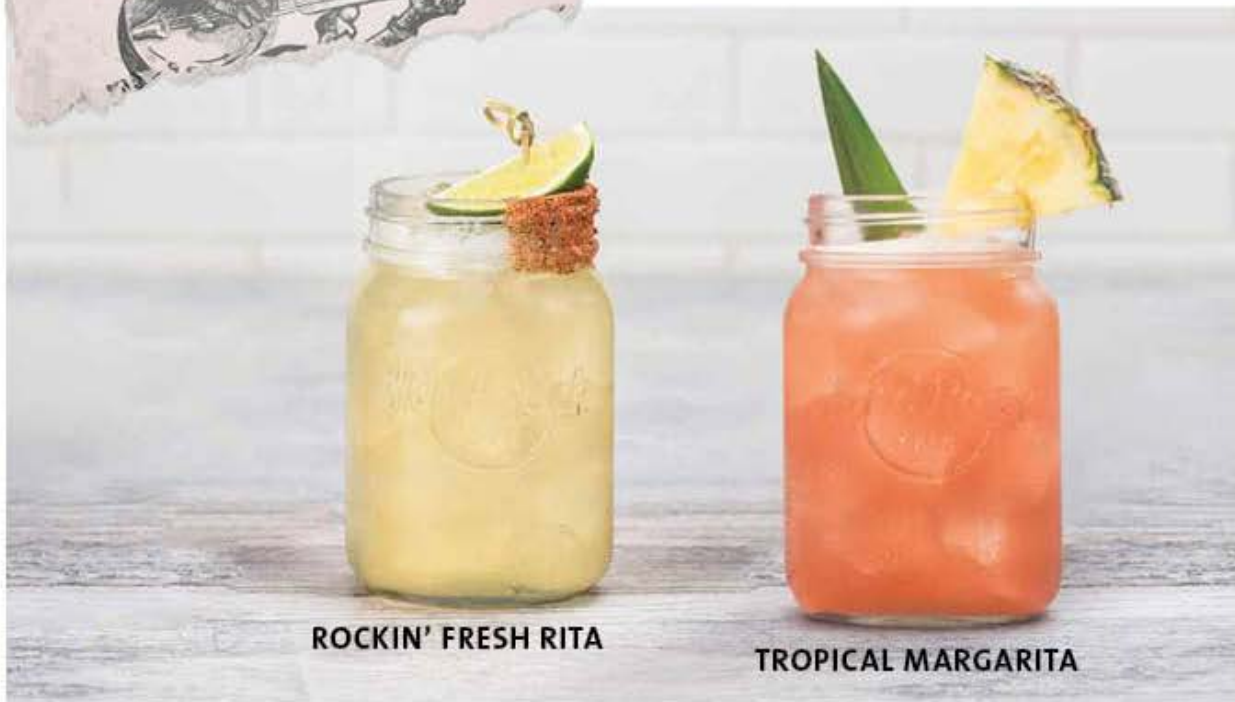
ROCKIN' FRESH RITA