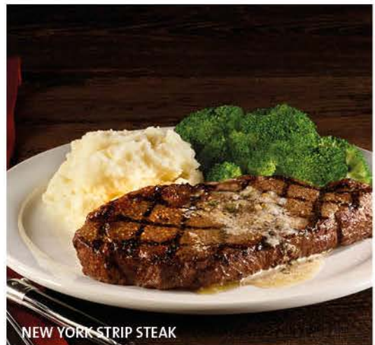
NEW YORK STRIP STEAK

We hold allergy information for all menu items, please speak to your server for further details. If you suffer from a food allergy, please ensure that your server is aware at the time of order. † Contains nuts or seeds. * These items contain (or may contain) raw or undercooked ingredients. Consuming raw or undercooked hamburgers, meats, poultry, seafood, shellfish or eggs may increase your risk of foodborne illness, especially if you have certain medical conditions.