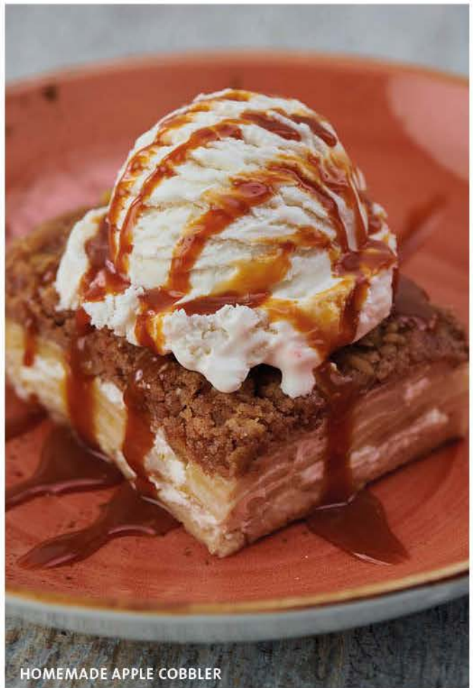
HOMEMADE APPLE COBBLER

We hold allergy information for all menu items, please speak to your server for further details. If you suffer from a food allergy, please ensure that your server is aware at the time of order. † Contains nuts or seeds. *These items contain (or may contain) raw or undercooked ingredients. Consuming raw or undercooked hamburgers, meats, poultry, seafood, shellfish or eggs may increase your risk of foodborne illness, especially if you have certain medical conditions.