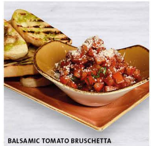
BALSAMIC TOMATO BRUSCHETTA

Roma Tomatoes marinated in balsamic vinegar and fresh basil topped with grated Romano served with a stack of toasted artisan bread and shaved parmesan on the side. IDR 89 (Single) | IDR 129 (Share)