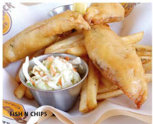
FISH N CHIPS