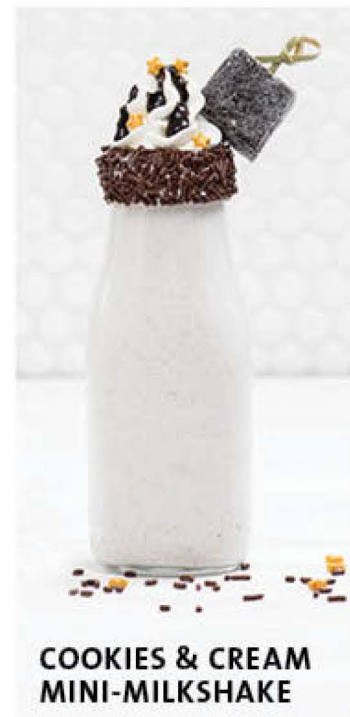
COOKIES & CREAM MINI-MILKSHAKE

All-natural vanilla bean ice cream blended with white chocolate and Oreo® cookies, finished with whipped cream and a sugar dusted house-made brownie square†. IDR 99