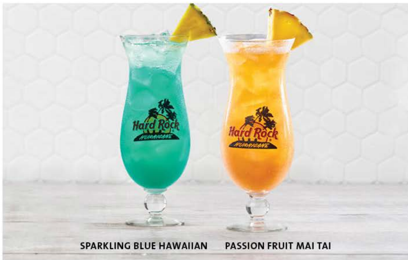
SPARKLING BLUE HAWAIIAN

Absolut Vodka, wedge of lime, topped with Red Bull energy drink. IDR 109