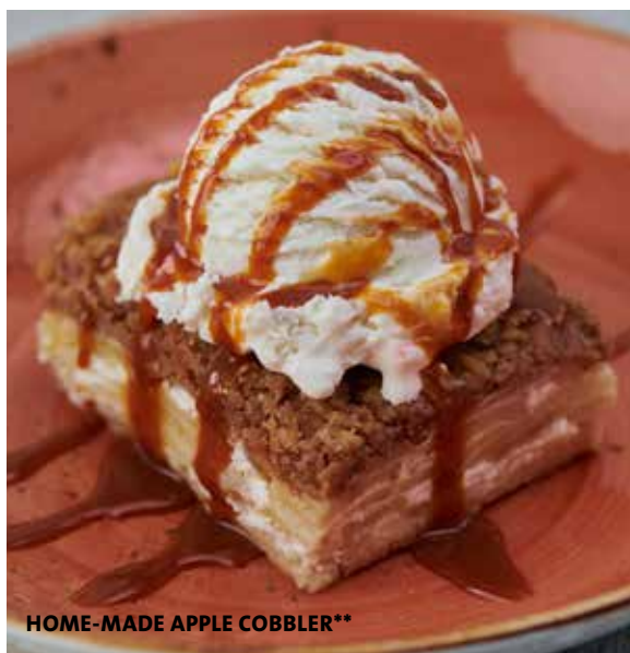
HOME-MADE APPLE COBLER**

Choose from Madagascar vanilla bean or rich chocolate.# €5.95