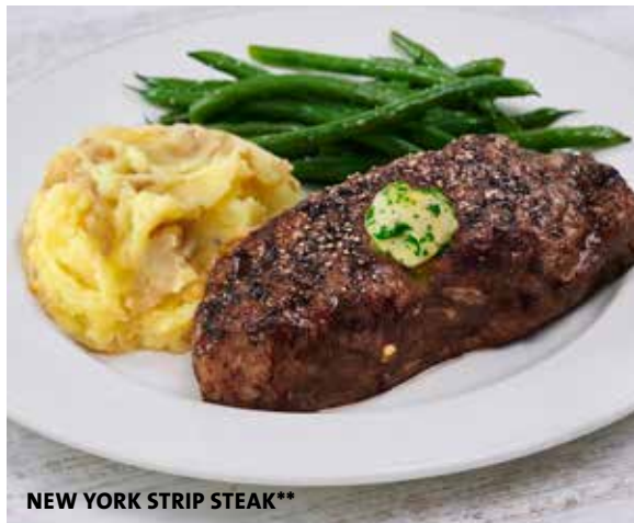
NEW YORK STRIP STEAK**

340gr New York strip steak**, grilled and topped with herb butter, served with golden mashed potatoes and fresh vegetables.# €26.45