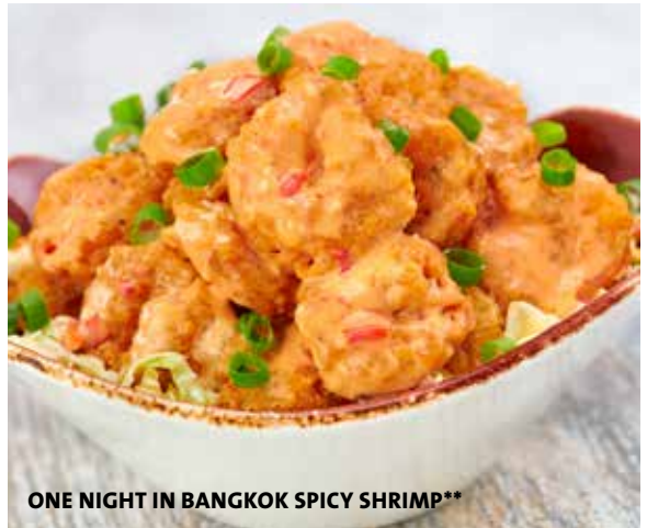
ONE NIGHT IN BANGKOK SPICY SHRIMP**