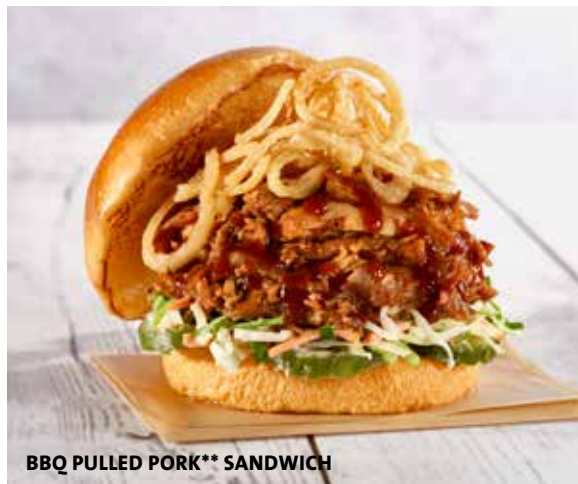
BBQ PULLED PORK** SANDWICH

170gr grilled fresh chicken with melted Monterey Jack cheese, smoked bacon**, leaf lettuce and vine-ripened tomato, served on a fresh toasted bun with honey mustard sauce.Δ €13.95