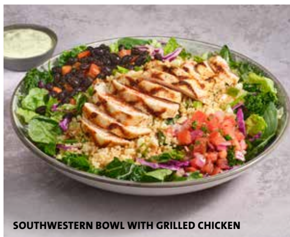
SOUTHWESTERN BOWL WITH GRILLED CHICKEN