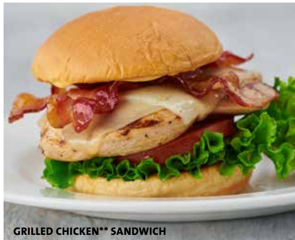
GRILLED CHICKEN** SANDWICH